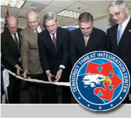
Ribbon-cutting ceremony at the Terrorist Threat Integration Center, May 1, 2003.

Two additional articles concern events separated by over two hundred years. One ( Document 4 ), focuses on Britain's penetration of the United States diplomatic mission to France during the Revolutionary War. Penetration involved British recruiting of agents with access to mission members, theft of a mission member's journal and Britain's control of agents ostensibly operating on behalf of the United States.