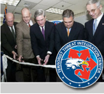
Ribbon-cutting ceremony at the Terrorist Threat Integration Center, May 1, 2003.

Two additional articles concern events separated by over two hundred years. One ( Document 4 ), focuses on Britain's penetration of the United States diplomatic mission to France during the Revolutionary War. Penetration involved British recruiting of agents with access to mission members, theft of a mission member's journal and Britain's control of agents ostensibly operating on behalf of the United States.