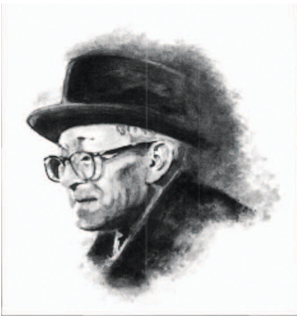
James Jesus Angleton, head of counterintelligence and "CIA's answer to the Delphic Oracle" from 1954-1974.

Various works on intelligence have noted both the past competition and present cooperation between the CIA and National Security Agency. 7 In "A Brave, New World" ( Document 14 ), the author states that the CIA and NSA "are moving their strategic partnership beyond the optional cooperation of the past into a new era of collaboration," and notes that the Director of Central Intelligence - George J. Tenet at the time - had viewed much of the success against al-Qaeda and its allies as the "direct result of CIA and NSA working together."