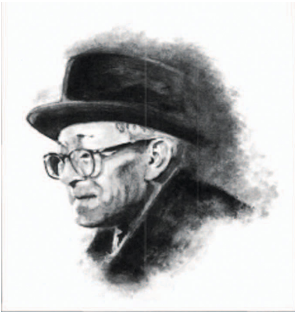
James Jesus Angleton, head of counterintelligence and "CIA's answer to the Delphic Oracle" from 1954-1974.

Various works on intelligence have noted both the past competition and present cooperation between the CIA and National Security Agency. 7 In "A Brave, New World" ( Document 14 ), the author states that the CIA and NSA "are moving their strategic partnership beyond the optional cooperation of the past into a new era of collaboration," and notes that the Director of Central Intelligence - George J. Tenet at the time - had viewed much of the success against al-Qaeda and its allies as the "direct result of CIA and NSA working together."