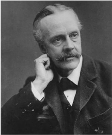
Arthur James Balfour (1848-1930)