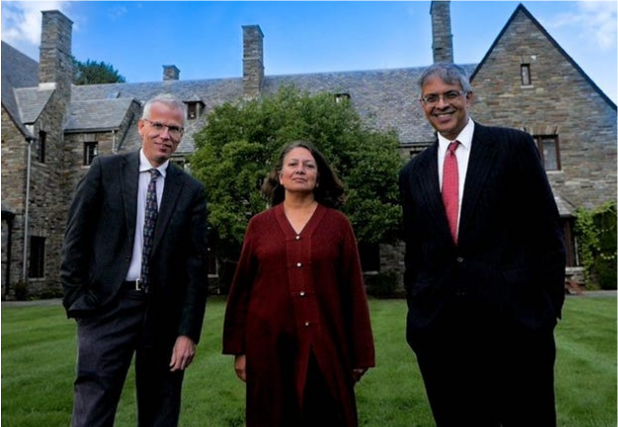
Martin Kulldorff, Sunetra Gupta, and Jay Bhattacharya: Thumos in medicine