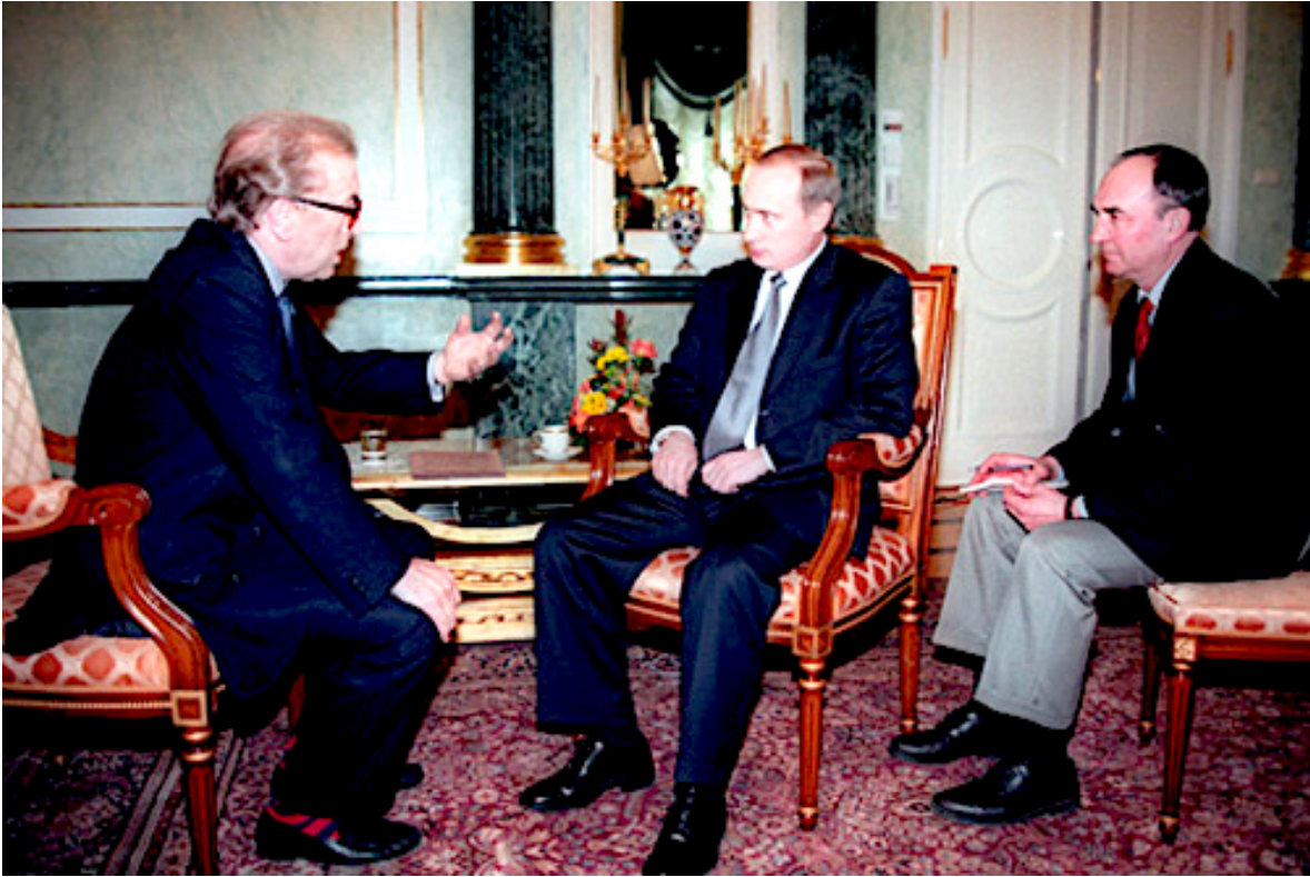
The BBC's David Frost interviewing Russian President Vladimir Putin at the Kremlin on March 5, 2000.