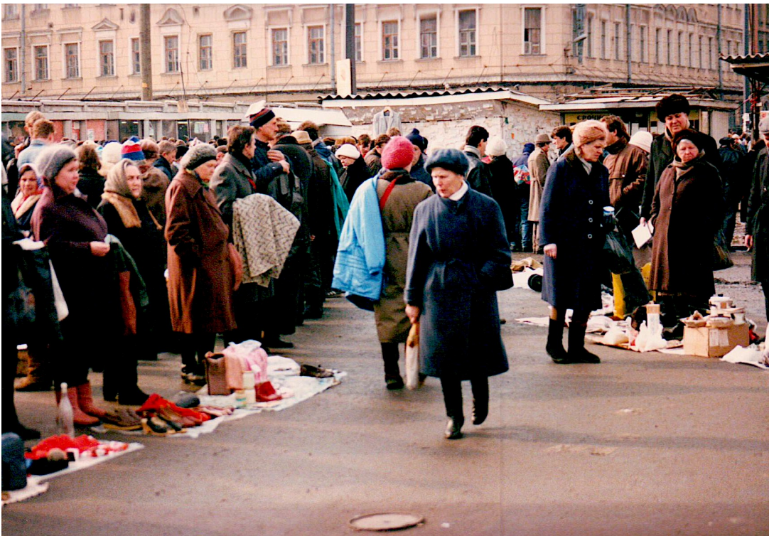
1992 flea market in Rostov-on-Don in southern Russia.

According to Western researchers , “an extra 2.5-3 million Russian adults died in middle age in the period 1992-2001 than would have been expected based on 1991 mortality.”