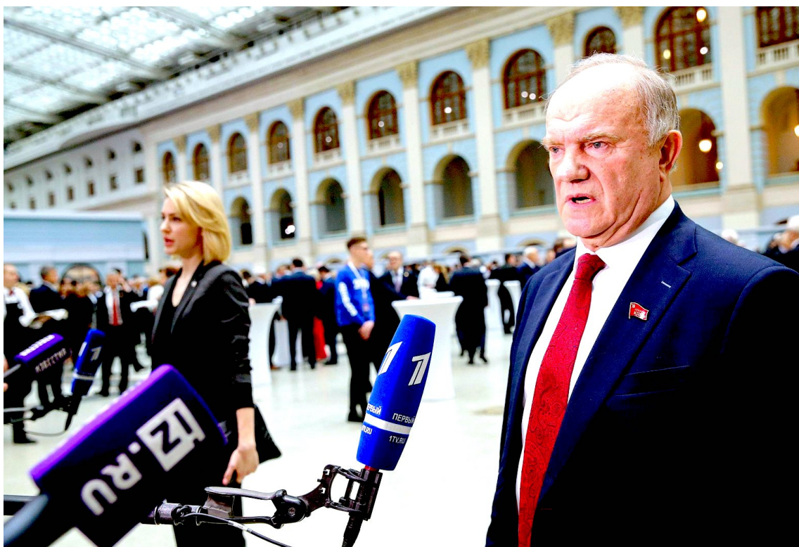
Gennady Zyuganov in February 2019, during Putin’s presidential address to the Federal Assembly.

On March 5, 2000, shortly before Putin was inaugurated following his victory over Gennady Zyuganov, leader of the Russian Communist Party, in the first presidential election following Boris Yeltsin’s resignation, the famous (and now departed) BBC journalist David Frost sat down for an interview with the Russian president-elect. The transcript of this interview is essential reading for anyone who seeks to “speak Putin.”