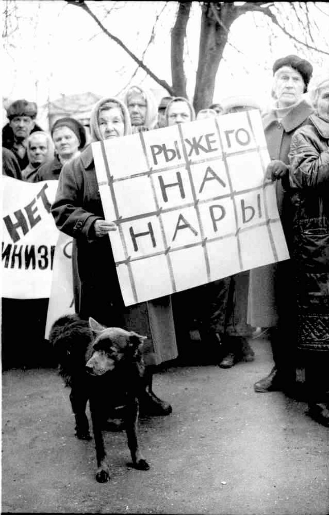
1998: Russians protest the economic depression caused by market reforms with banner saying: "Jail the redhead!" referring to Anatoly Chubais, the Russian economist who oversaw Yeltsin-era privatizations.

These pundits, whom I have classified as " Putin whisperers ," have had a hugely detrimental impact on fact-based discourse about Russia today.