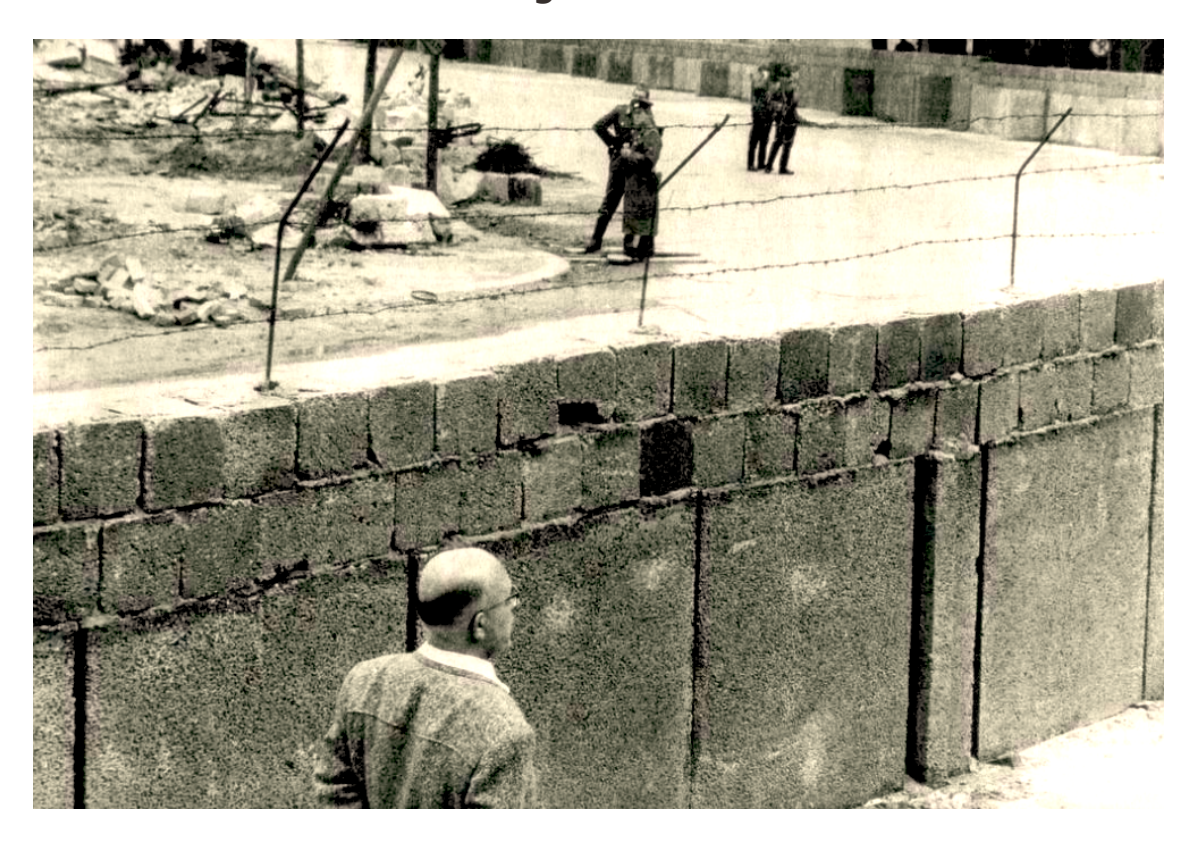
Berlin Wall in 1961.

The problem is, those in the West who should be preparing a proper lexicon from which the Russian-Ukraine conflict could be more accurately assessed are instead operating from an outdated lexicon rooted in the language and mindset of a time that no longer exists, born of a Cold War mentality that prevents any deep-seated and relevant analysis of the true situation between Russia and the West.