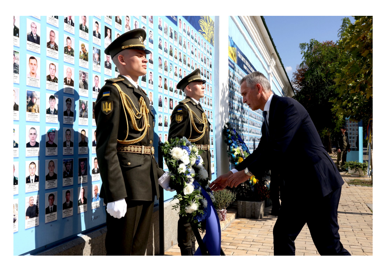
Stoltenberg laying a wreath at the Wall of Remembrance of the Fallen for Ukraine on Sept. 28.

Today, Ukraine finds its military decimated by the fighting and unable to sustain itself as a cohesive combat force on the field of battle. The U.S. and NATO likewise find themselves unable and/or unwilling to continue supplying Ukraine with the money and material needed to continue to maintain a viable military presence on the battlefield.