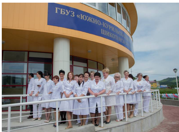
New hospital on Shikotan