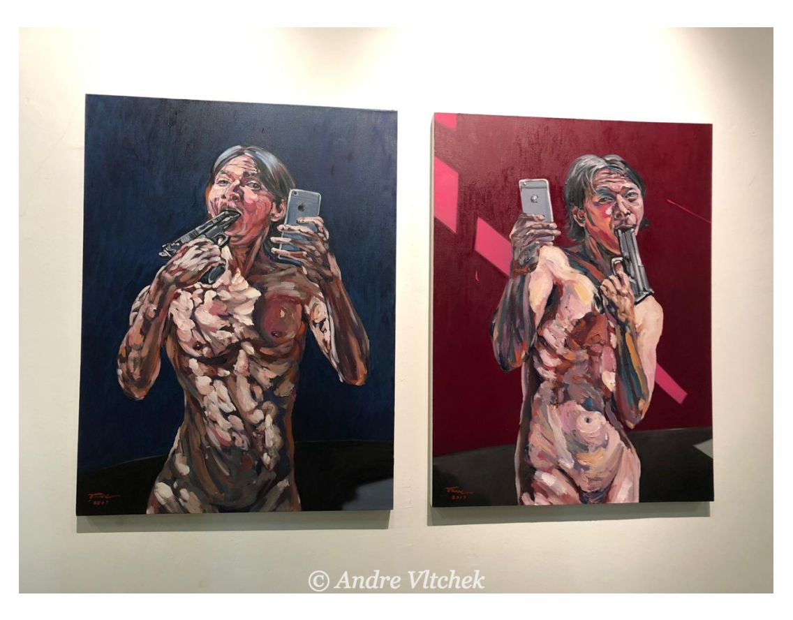
In Bangkok, depiction of modern Thai reality