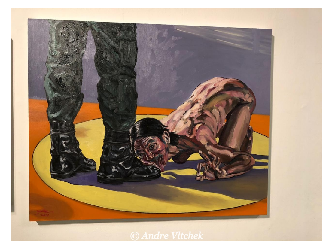
Artwork at BACC, before Thai elections

The coastline of Thailand is totally finished. The once pristine islands are now dotted with mass-produced, low quality market towns, with makeshift bungalows and ugly concrete structures. There are standardized, repetitive 'offerings', most of them of extremely low-quality. There are Thai and Western 'beach food', bad old (Western) pop music, countless massage parlors and ersatz bars. There is almost nothing truly Thai left on the Thai coastline. Thai women, the poorest of the poor, many from the north of the country, walk in flip-flops and tasteless T-shirts hand in hand with Western grandfathers, some of them in their 80's. What a sight!