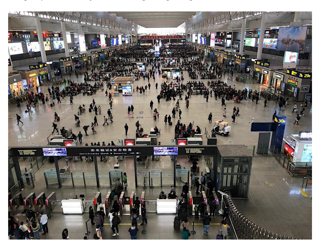
Huanzhou high-speed train station - one of the biggest in the world

To liberate from whom? China does not, (unfortunately for Hong Kong), interfere in Hong Kong's economic and social affairs. If anything, it builds new infrastructure, like an enormous bridge now connecting Hong Kong with Macau (a former Portuguese colony) and a high-speed train system, linking Hong Kong with several cities in Mainland China.