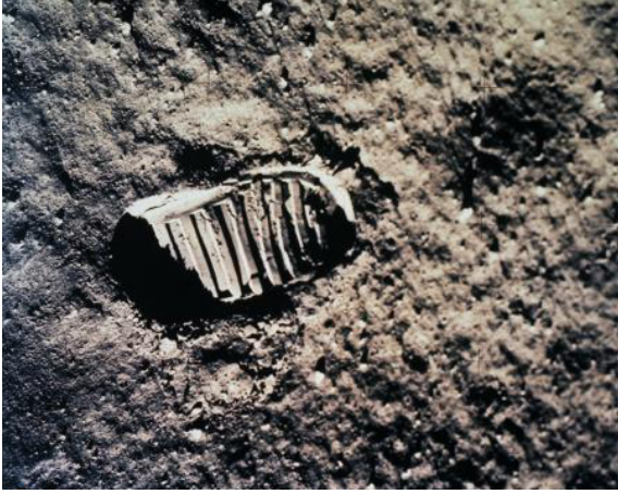
Footprint left on the moon by an Apollo 11 astronaut.