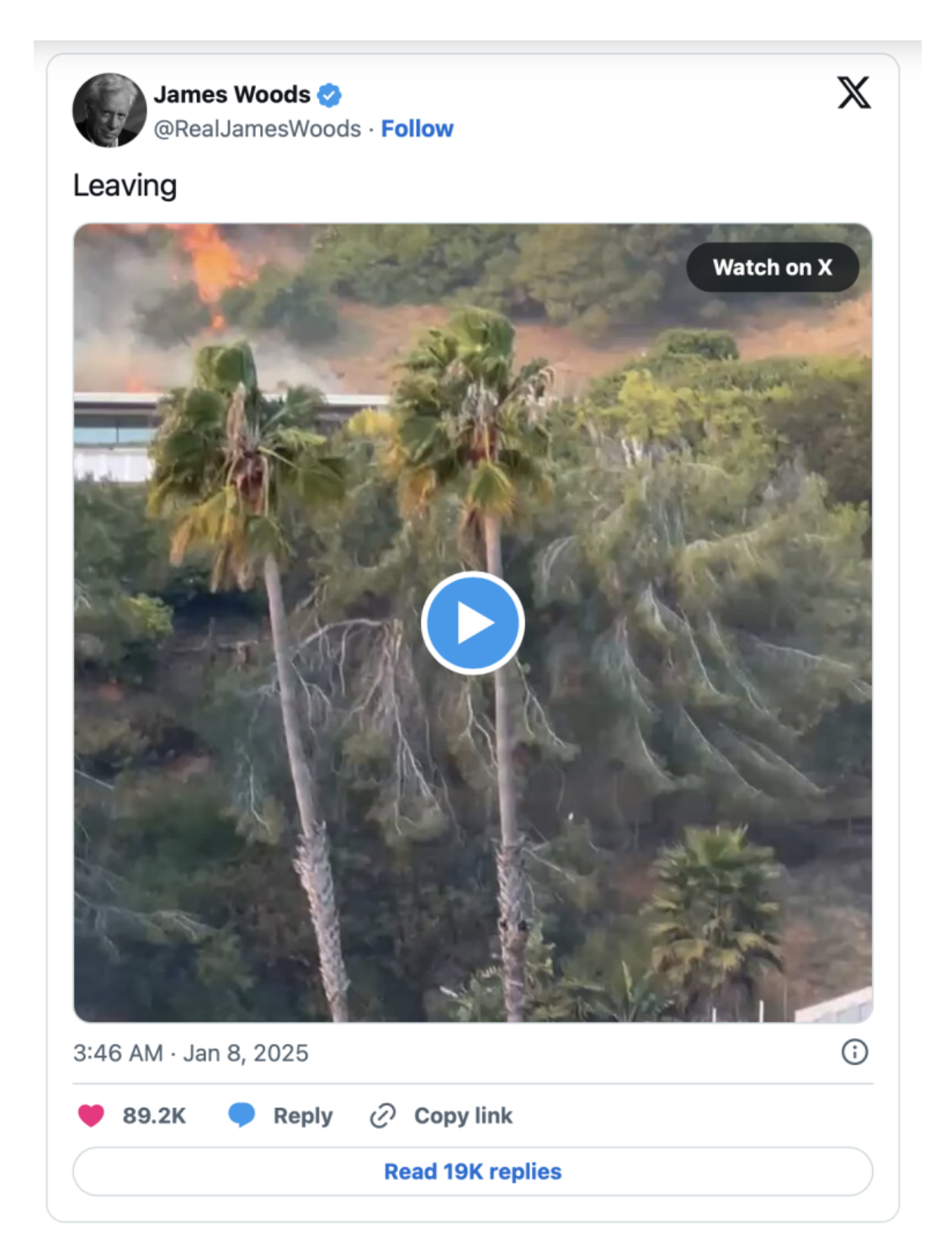
Watch on X