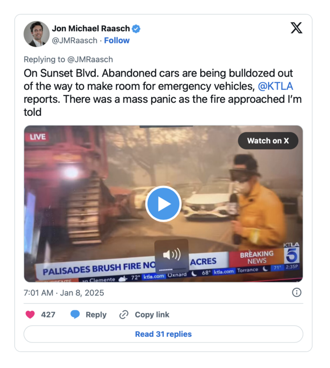
Watch on X

California's Democrat Governor Gavin Newsom was on ground watching his state burn down as Democrat legislators refuse to properly manage underbrush.