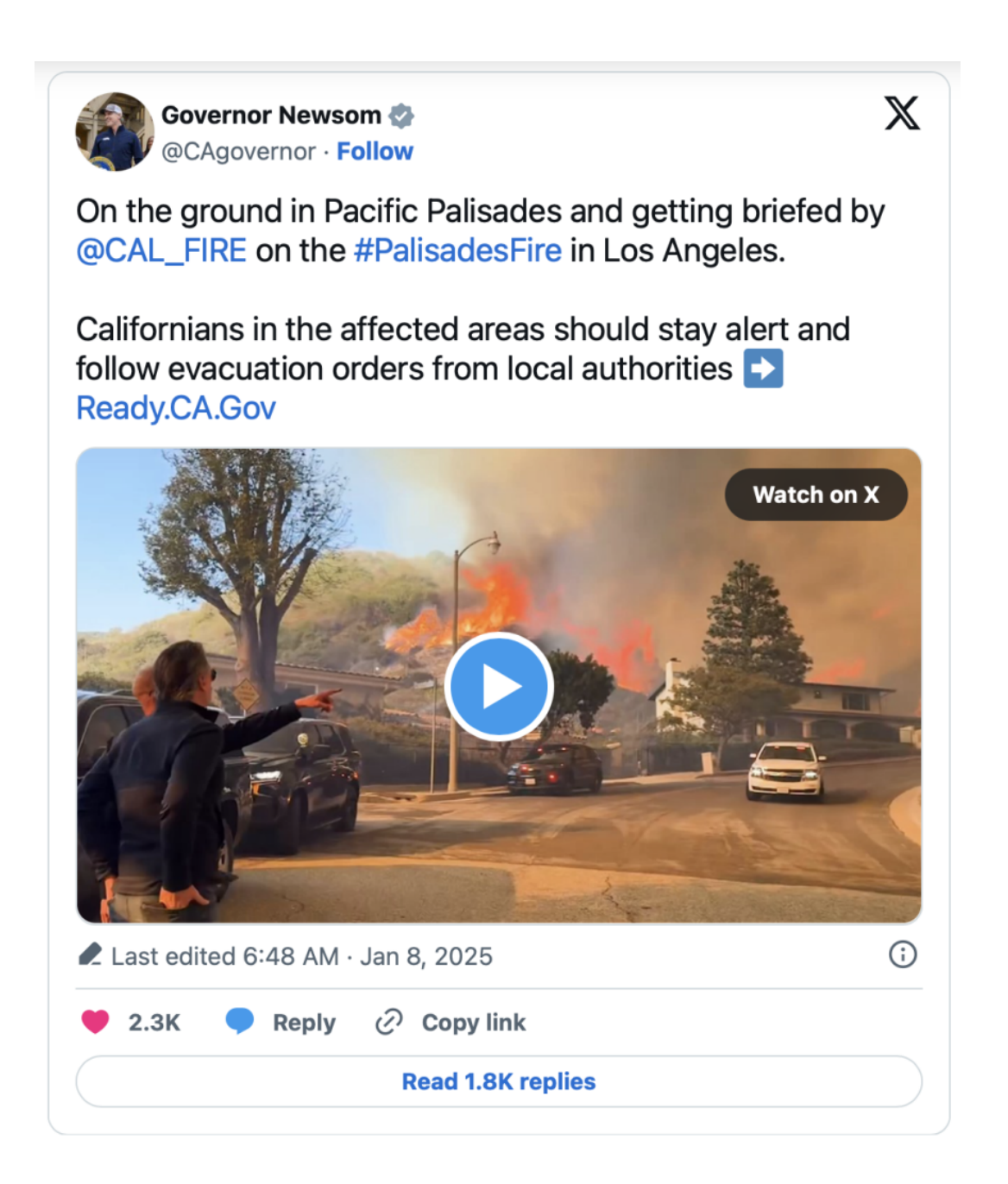
Watch on X