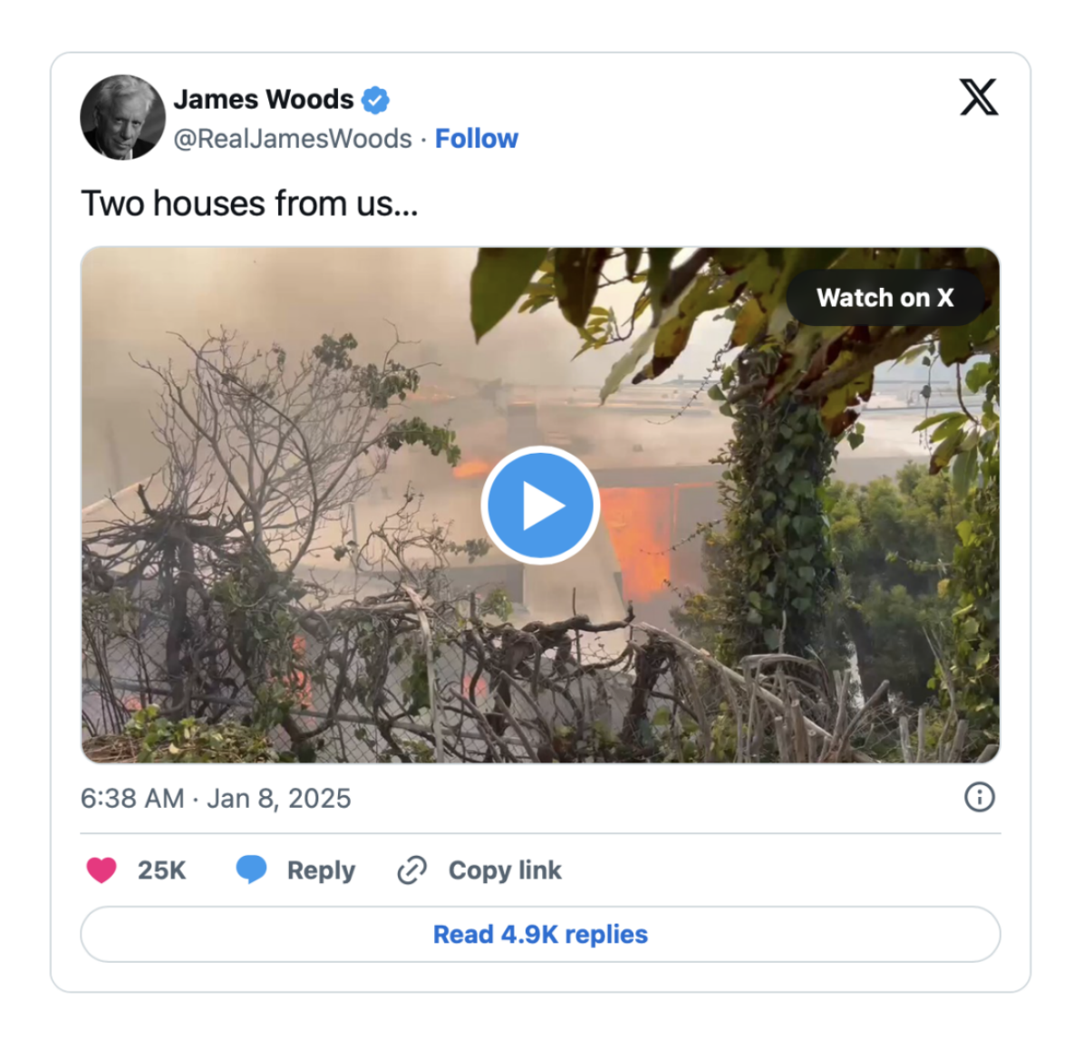
Watch on X