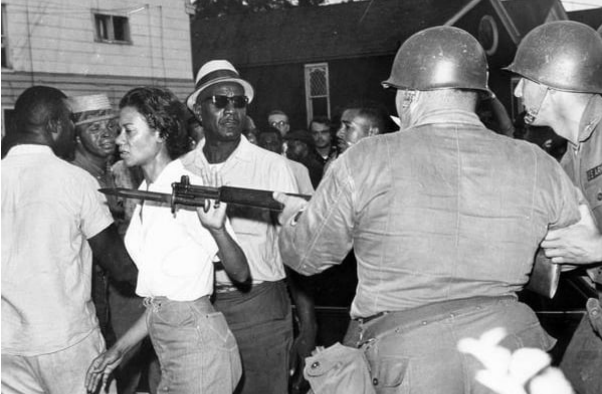
Cambridge Nonviolent Action Committee leader Gloria Richardson