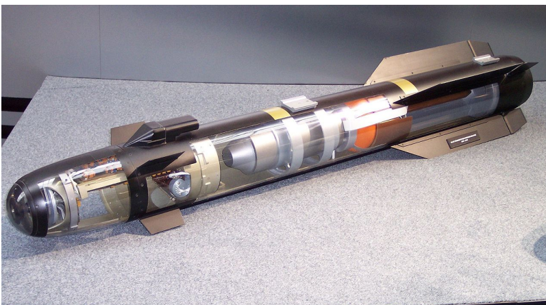
AGM-114 Hellfire missile

The vast majority of weapons launched from US and UK drones have been Hellfire missiles which use, like other laser-guided munitions, semi-active radar homing. An invisible laser beam which is pulsing at a specific rate of microseconds is aimed at a target. The laser can come either from the drone itself or from someone operating on the ground. The laser beam scatters off the target in many directions, pulsing at a pre-set specific rate. Once launched, the missile seeks out the beam pulsing at the specific rate it is set to find, and then steers itself towards the centre of that signal, thereby homing in on the target.