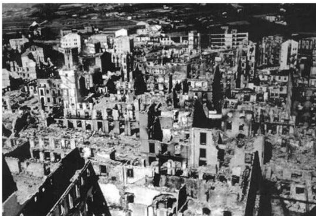
Ruins of Guernica

And thus, in Guernica, a new form of war was born, a new breed of terror that would become the model for “Blitzkrieg” attacks in Poland and France a few years later.