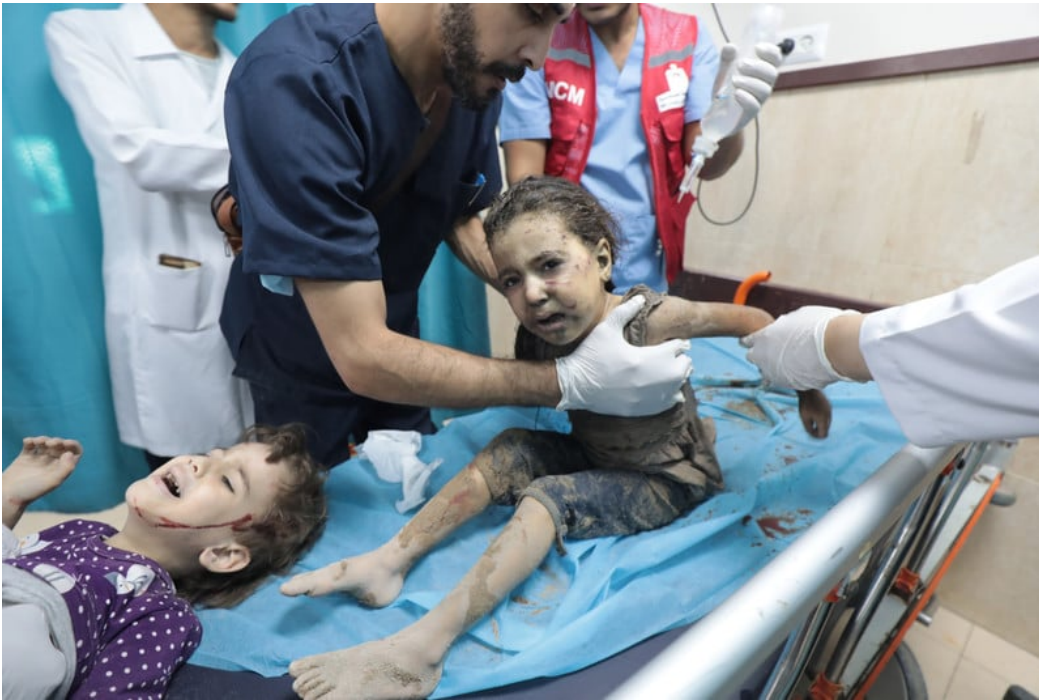
Gazan child at a hospital after an Israeli airstrike

its citizens controlled and destroyed, and the space entirely rebuilt to serve a different population without any possibility of resistance. The knowhow being developed in the process will not only be used to target Palestinians, it will be used against everyone, including Israelis.