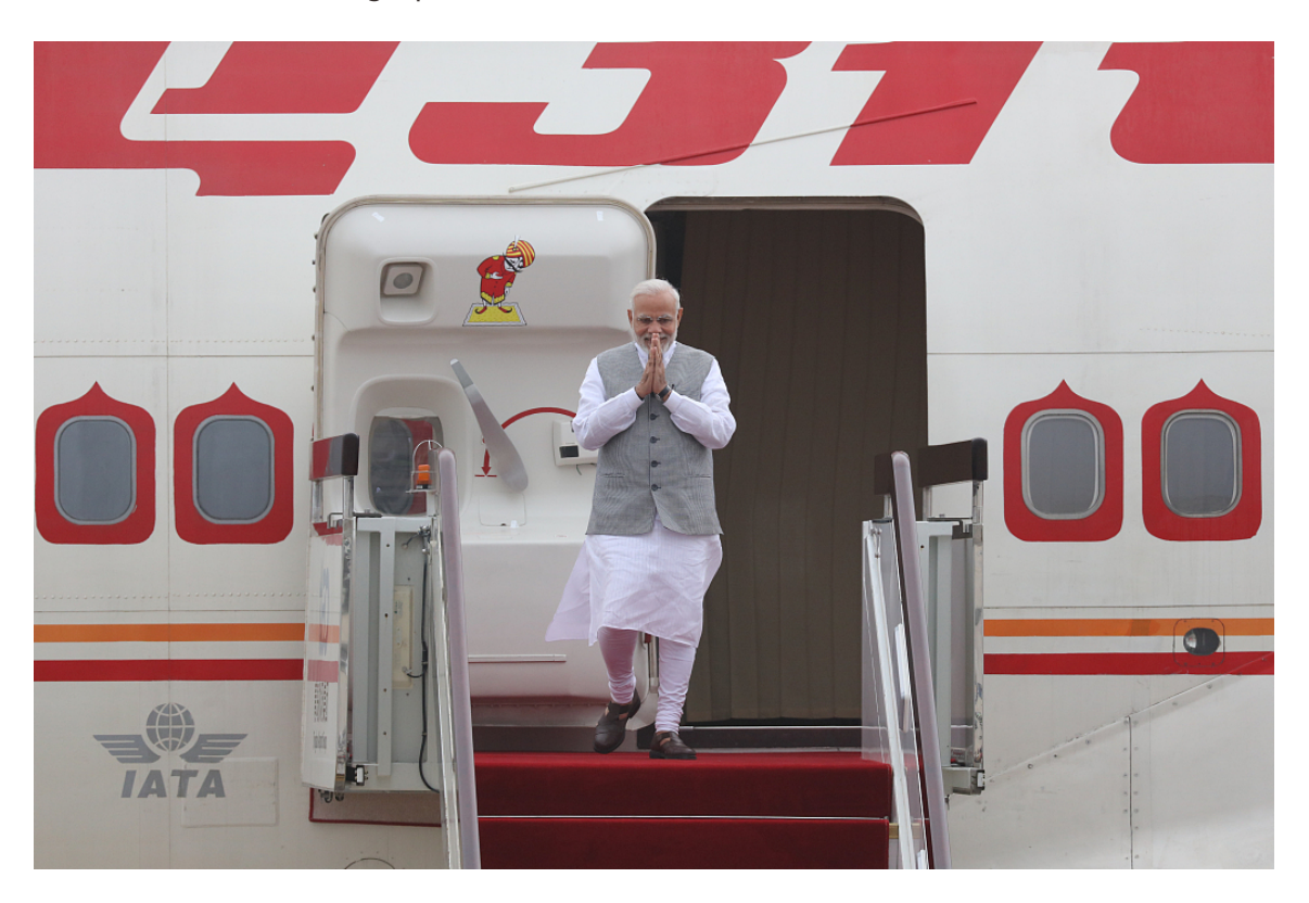
Indian Prime Minister Narendra Modi arrives in Qingdao to attend the SCO Qingdao Summit in Qingdao, China, June 9, 2018.

fled a large-scale anti-terrorist operation in Myanmar's Rakhine State back in 2017 that some countries criticized as excessive and possibly even deliberately targeting the civilian members of this demographic.