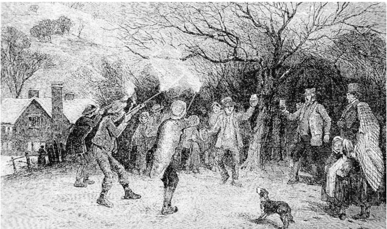
Image: Wassailing the apple tree

In parts of Medieval Britain, a different sort of wassailing emerged: farmers wassailed their crops and animals to encourage fertility. An observer recorded, "They go into the Ox-house to the oxen with the Wassell-bowle and drink to their health." The practice continued into the eighteenth century, when farmers in the west of Britain toasted the good health of apple trees to promote an abundant crop the next year. Some placed cider-soaked bread in the branches to ward off evil spirits. In other locales, villagers splashed the trees with cider while firing guns or beating pots and pans.