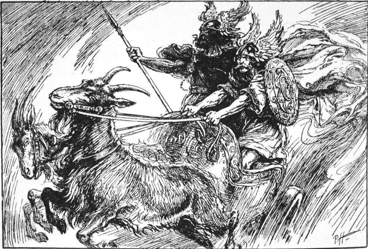
THOR AND TYR IN THEIR GOAT-DRAWN CHARIOT