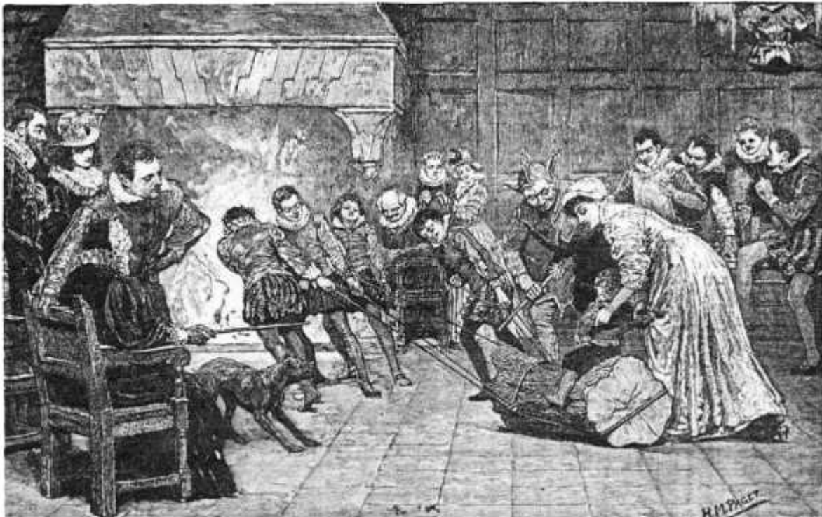
Image: Yule log

Our awareness of mid winter and the solstice ('sun stands still') is shown to go back to the late Neolithic and Bronze Age with Newgrange in Ireland and Stonehenge in England. In both cases the monuments have been aligned to the solstice, sunrise at Newgrange and sunset at Stonehenge. It has been the occasion of celebrations, rituals and gatherings as the sun appears to be reborn and the days start getting longer again. After this time food became scarce (January to April) which were known as the 'famine months'. It was the last feast of the year as cattle were slaughtered and wine and beer were ready for drinking. The 'rebirth' of the sun was known as Sol Invictus or the 'unconquered sun' god during the Roman Empire in the 3rd century CE and the Emperor Aurelian dedicated a temple to Sol to be celebrated on December 25. Solar deities have been represented as both gods and goddesses in different cultures and are particularly important in mid winter when the sun is low in the sky. In many countries in Europe the tradition of the Yule log burning was an important festival to help strengthen the weakened sun.