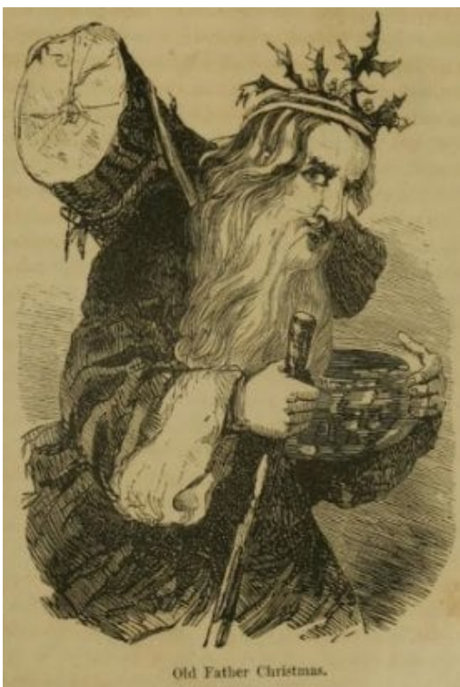
Image: Father Christmas 1848

Presumably the masters could not cope with the concept of equality and saw Saturnalia instead as a role reversal. In pre-industrial England people would elect a Lord of Misrule who would be in charge of Christmas festivities and who even had license to poke fun at the nobility.[7] Yet the Lords of Misrule were an important aspect of Christmas as the reversal of traditional social norms was a safety valve for class tensions in England. It was around this time that the personification of Christmas as Father Christmas began to appear.