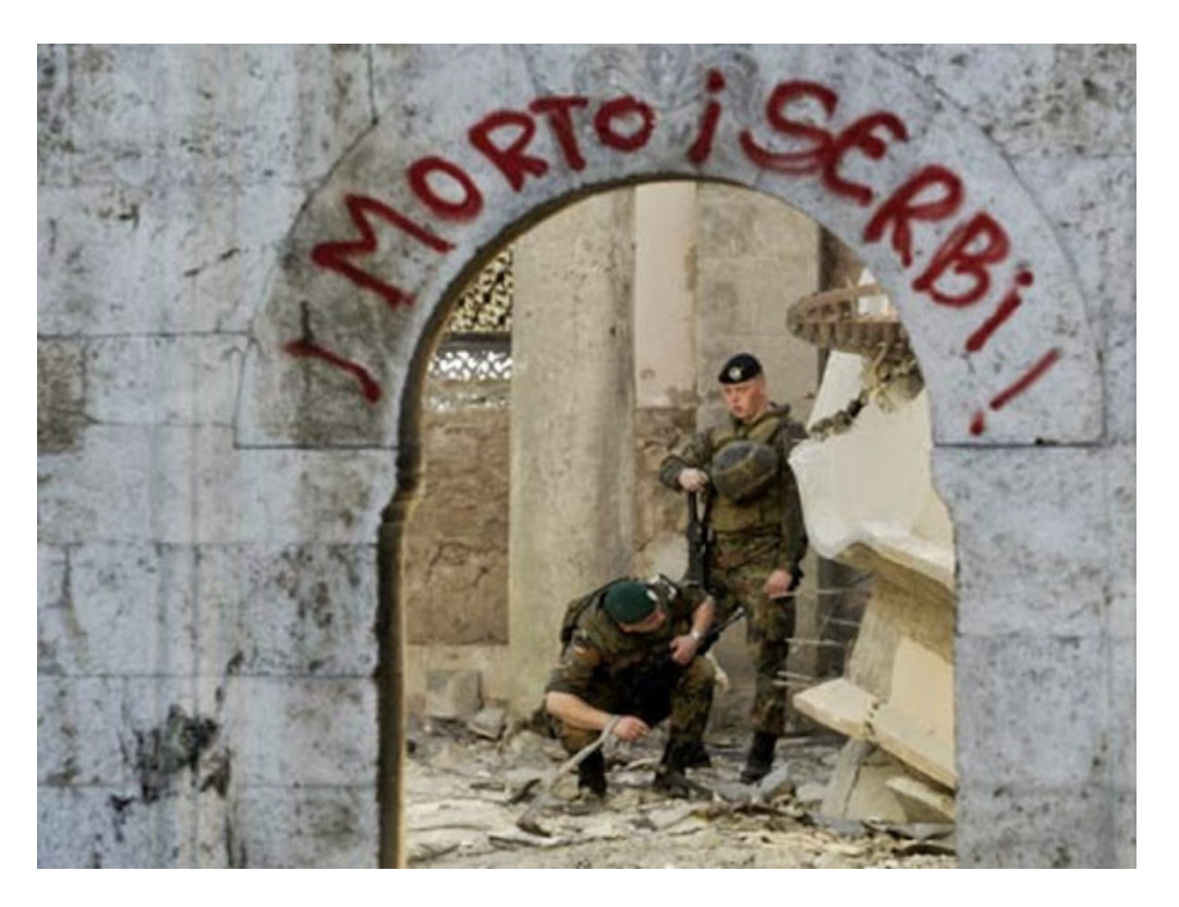
NATO occupying forces inspect the 'work' of their Albanian terrorist comrades who shelled this Orthodox church in Kosovo

At a time when the violent separation of Kosovo and Metohija from Serbia has triggered a wave of separatism in the EU, we are not questioning Brussels officials about their responsibility. When the aggressive US foreign policy led to historical migrations from the Middle East to Europe, due to the bombing and destruction of countries in the Middle East, we are not asking who is responsible for this? Who is responsible for the rise of terrorism in the world?