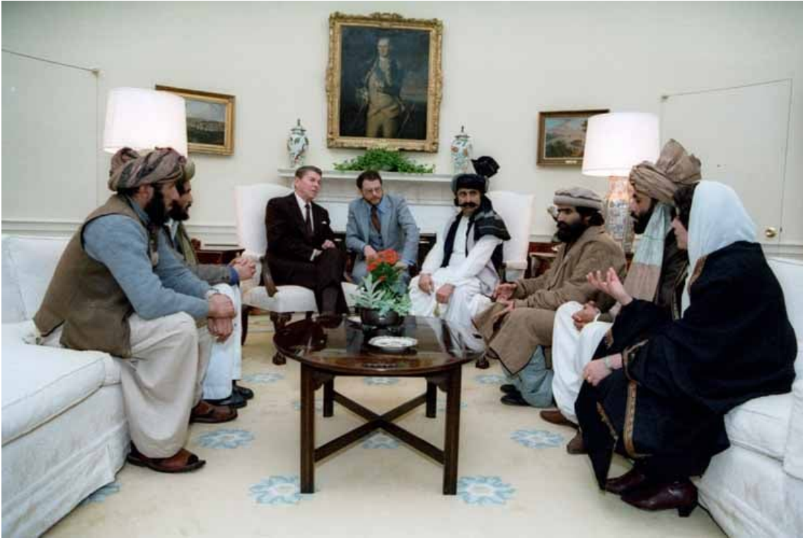
Ronald Reagan meets Afghan Mujahideen Commanders at the White House in 1985