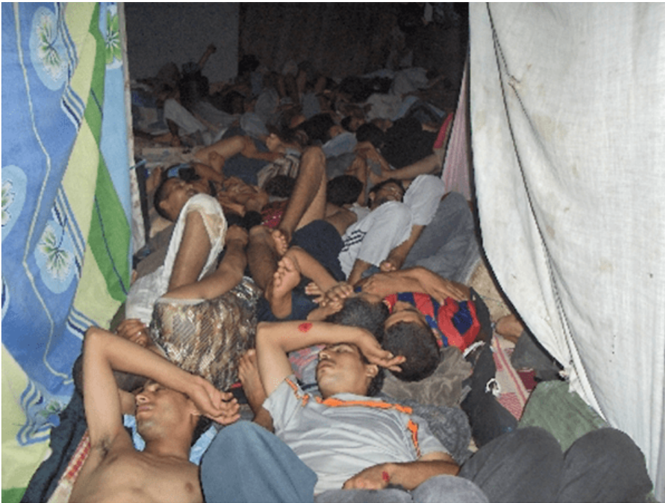
Woeful overcrowding at Tramacúa prison.

The U.S. model of mass incarceration is something we should be ashamed of. Instead, we export it around the world. We call this Prison Imperialism . It started in 2000 with an agreement between the U.S. and Colombian governments to restructure Colombia's prison system, spread from there to Guantánamo in occupied Cuba, Bagram in Afghanistan, and Abu Ghraib in Iraq. Today the U.S. is building an Empire of Prisons across the Global South.