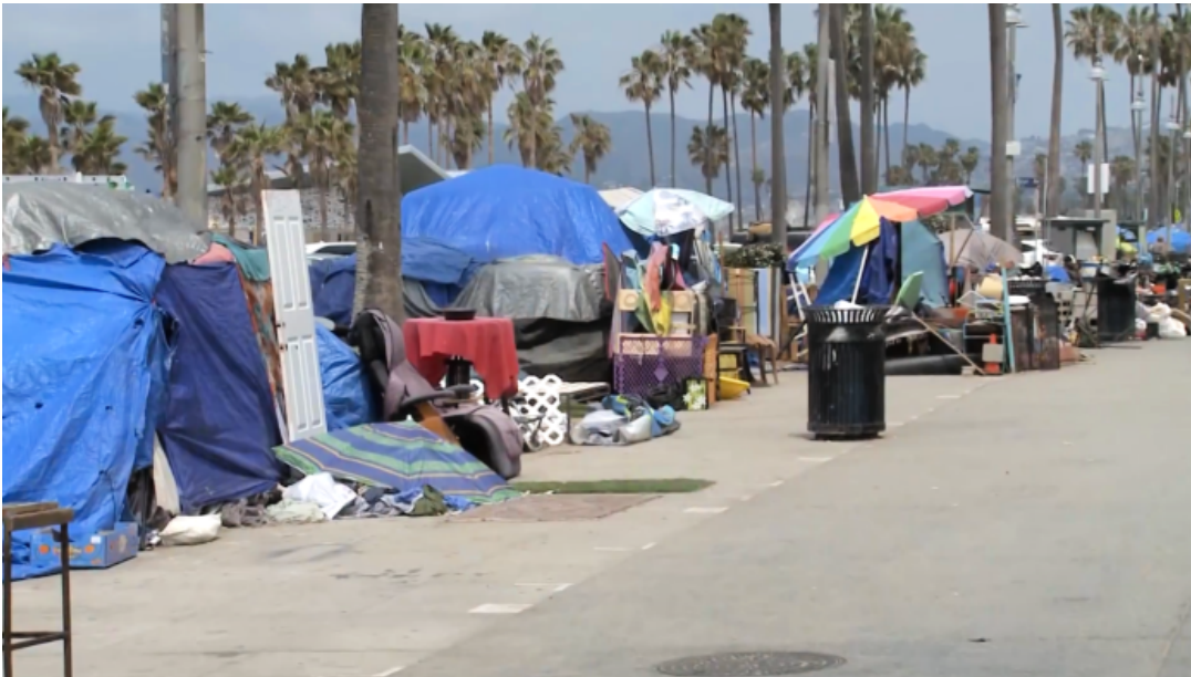
Homeless row at Venice Beach.

The starting point of any discussion about reality in the United States has to be around the topic of racism. One Black man of every 1,000 Black men can expect to be killed by a police officer. Likewise, class oppression and racism are deeply intertwined in the U.S. Homelessness is part of our national fabric and identity.