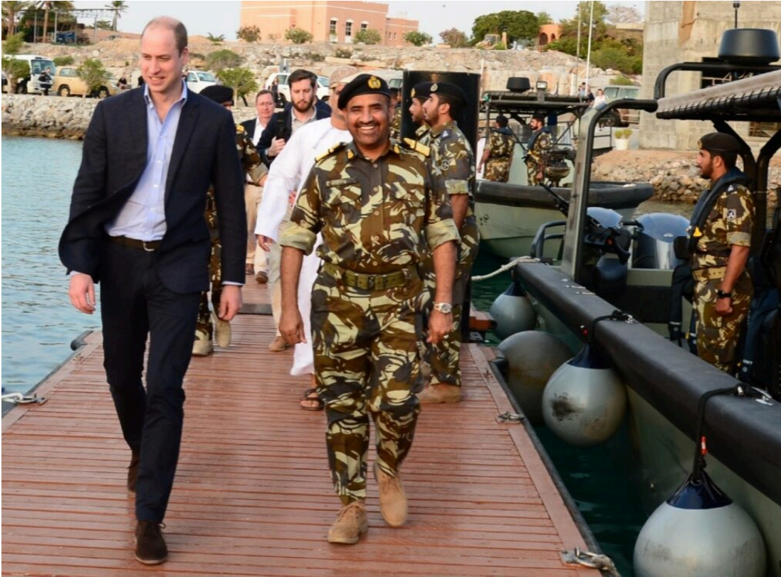
Prince William in Musandam followed by an ex-GCHQ strategy director

The strategic location means British spy agency GCHQ is rumoured to have built a surveillance station somewhere in Musandam, to intercept communications from across the Gulf. Sultan Qaboos let a company run by an ex-CIA officer build much of the peninsula's infrastructure.