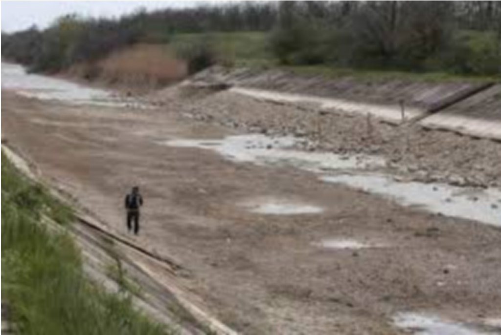
The Northern Crimea Canal after Ukraine blocked the water supply.

Shortly afterwards, Ukraine built a concrete dam on the North Crimean Canal, a Soviet-era conduit transporting water from the Dnieper River that provided around 85% of the peninsula's water supply. In doing so, Ukraine effectively destroyed Crimea's agricultural industry. Then, in November 2015, Ukrainian nationalists blew up pylons carrying power lines from Ukraine to Crimea, thrusting the peninsula into a blackout that prompted a declaration of emergency by the regional government.