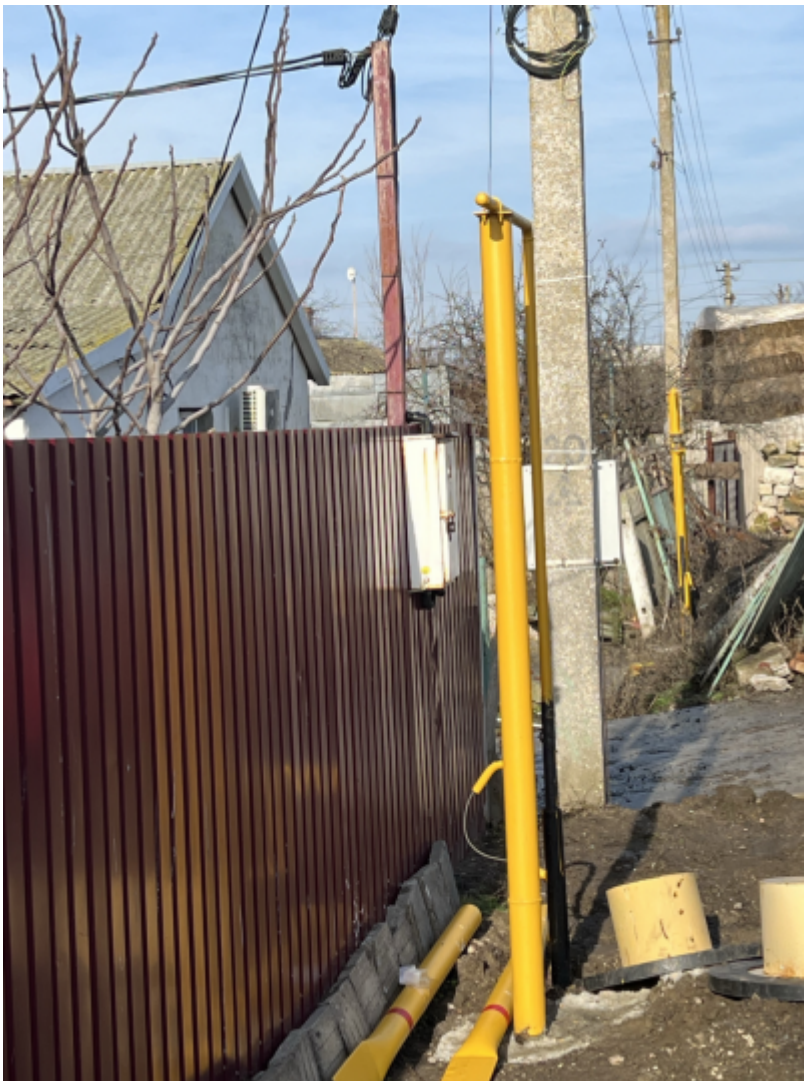
Gas lines being installed outside Fatima's home in Batalnoye, January 2024

They had felt their house shake when Ukrainian missiles struck the Novocherkassk, and their nights were often interrupted by the sounds of Ukrainian drones flying overhead, and the launch of Russian air defense missiles in response. It's a hard life, made even more so by the neglect shown the village during the time of Ukrainian rule.