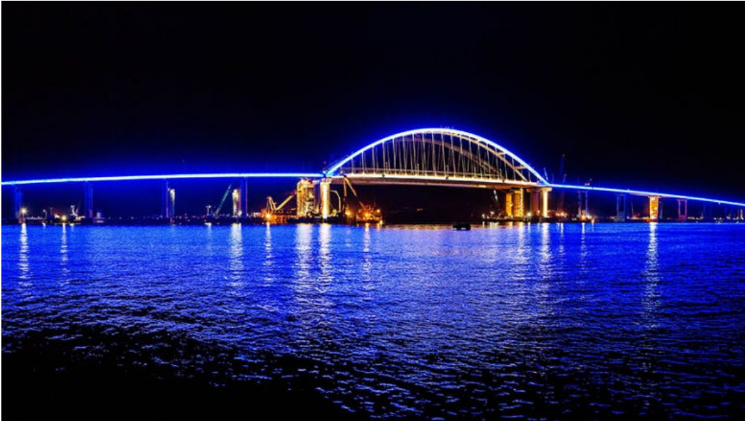
The Crimean Bridge at night.

But the greatest symbol of Russia's commitment to the people of Crimea was the construction of a $3.7 billion, 19-kilometer-long road-and-rail bridge connecting Krasnodar Region in southern Russia with the Crimean Peninsula. The bridge is the longest in Europe. Construction began in 2016, and it was opened for car traffic in a little more than two years. It has become a symbol of pride for the Russian people and their leadership; President Vladimir Putin personally drove across the bridge during its formal opening ceremony in 2018. The rail line was opened to passenger traffic in 2019, and freight traffic in 2020. The construction of the Crimean Bridge coincided with the building of the Tavrida Highway, a 250-kilometer, $2.5 billion four-lane road connecting the Crimean Bridge with the cities of Sevastopol and Simferopol. Construction of the road began in 2017 and is still ongoing.