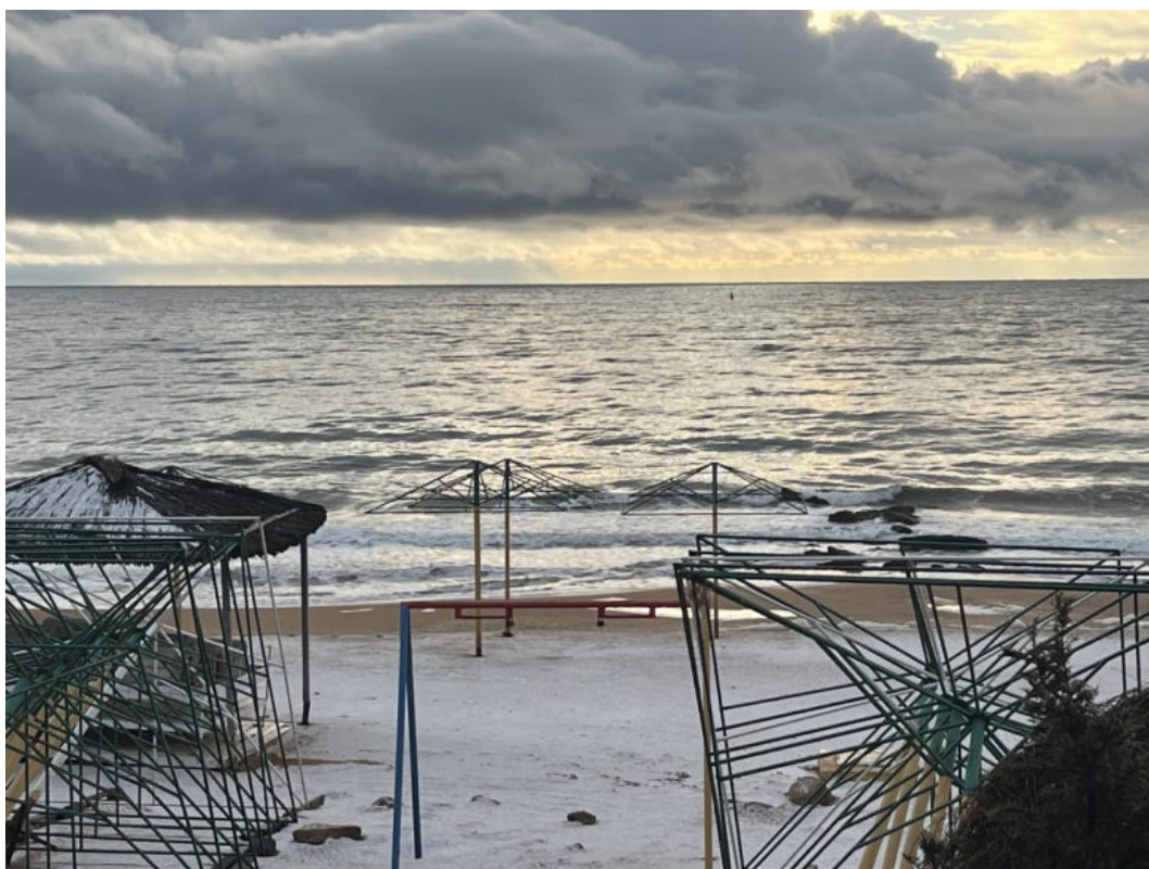
The Black Sea beachfront at Feodosia.

War has not escaped Feodosia. On December 26, 2023, the Ukrainian air force launched several Storm Shadow cruise missiles at Feodosia, some of which penetrated Russian air defenses, hitting the Novochoerkassk, a large landing ship, and lighting up the night sky in a dramatic fireball. And anyone driving in and around Feodosia cannot help but notice the presence of Russian defenses.