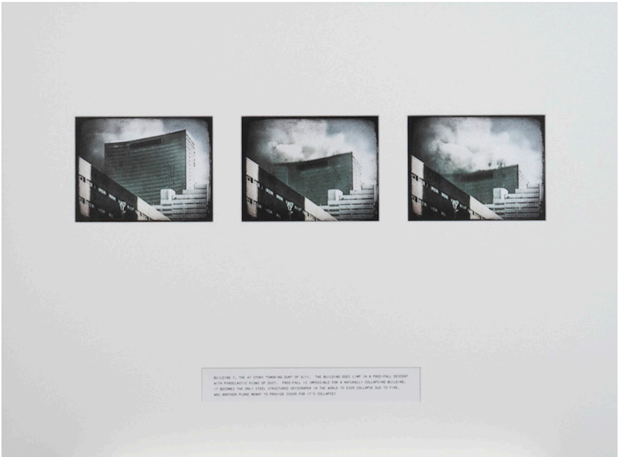
BUILDING 7, THE 47 STORY "SMOKING GUN" OF 9/11. THE BUILDING GOES LIMP IN A FREE-FALL DESCENT WITH PYROCLASTIC FLOWS OF DUST. FREE-FALL IS IMPOSSIBLE FOR A NATURALLY COLLAPSING BUILDING. IT BECOMES THE ONLY STEEL STRUCTURED SKYSCRAPER IN THE WORLD TO EVER COLLAPSE DUE TO FIRE. WAS ANOTHER PLANE MEANT TO PROVIDE COVER FOR 11'S COLLAPSE?

“Building 7 . . . goes limp in a free-fall descent with pyroclastic flows of dust. Free-fall is impossible for a naturally collapsing building. It becomes the only steel structured skyscraper in the world to ever collapse due to fire.” Support for Riskin’s claims, most of which are undisputed factual observations, can be found in 9/11: Explosive Evidence — Experts Speak Out, World Trade Center 7, Part 5 , and in several peer-reviewed papers, including “ The collapse of WTC 7: A re-examination of the ‘simple analysis’ approach ” in the Challenge Journal of Structural Mechanics. (Fredric Riskin, 9/11 The Collapse of Conscience, 20” X 27”, Panel 24 of 43, Printed on kozo-backed Gampi using pigment inks. Courtesy the artist and Ronald Feldman Gallery, NY.)