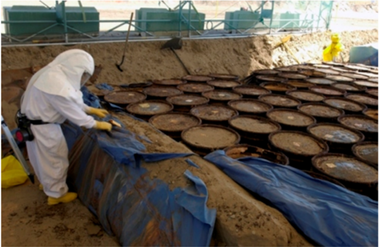
Worker with radioactive waste at Hanford

In the Hiroshima and Nagasaki studies, by contrast radiation exposure was estimated on the flimsiest of guesswork. The radiation emitted by the bombs was calculated according to tests done in the Nevada desert and was recalculated several times in subsequent decades. Researchers asked such questions as, where were you standing in relation to the blast, what was between you and it, what had you had for breakfast that morning, assuming that the survivors would give reliable accounts five years after the event.