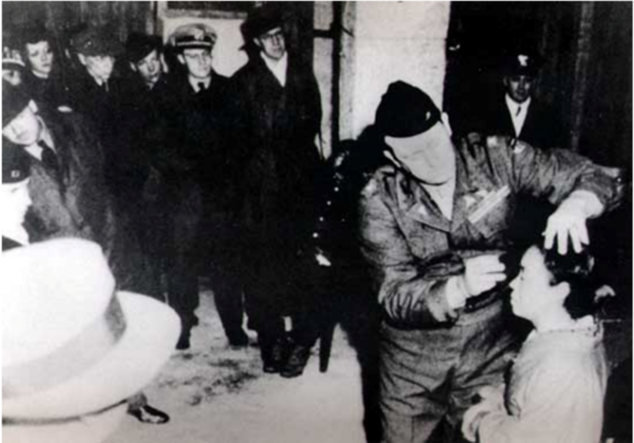
ABCC examination of Hiroshima victim

The Japanese physicians and scientists who'd been on the scene told horrific stories of people who'd seemed unharmed, but then began bleeding from ears, nose, and throat, hair falling out by the handful, bluish spots appearing on the skin, muscles contracting, leaving limbs and hands deformed. When they tried to publish their observations, they were ordered to hand over their reports to US authorities. Throughout the occupation years (1945-52) Japanese medical journals were heavily censored on nuclear matters. In late 1945, US Army surgeons issued a statement that all people expected to die from the radiation effects of the bomb had already died and no further physiological effects due to radiation were expected. 6 When Tokyo radio announced that even people who entered the cities after the bombings were dying of mysterious causes and decried the weapons as "illegal" and "inhumane," American officials dismissed these allegations as Japanese propaganda. 7