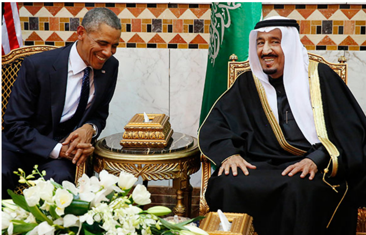
Photo caption: PATRONAGE: President Obama paying tribute to the new King Salman of Saudi Arabia

Even in the 21st century, Saudi Arabia still manages to win the near submissive support of the US and the UK, despite the fact that it is running an openly regressive, medieval theocratic autocracy, where hundreds of its citizens are executed in the street, many via beheading. Last year, in 2015, was a record year for beheadings under the newly crowned King Salman .