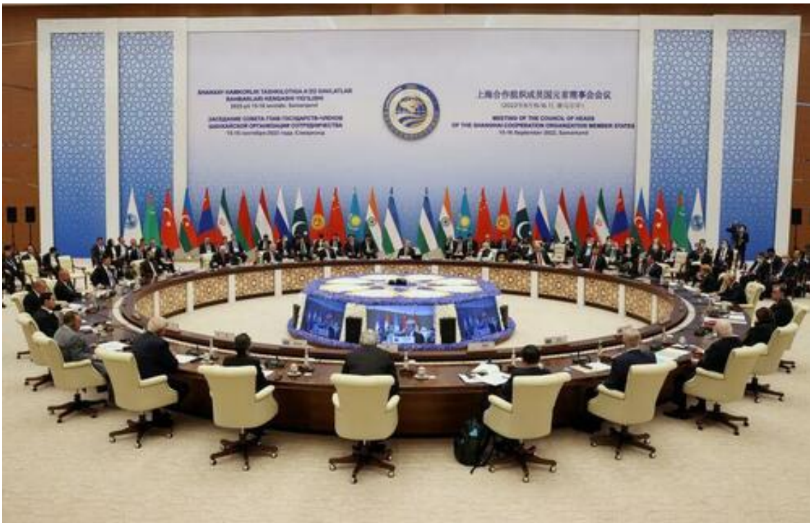
Participants of the Shanghai Cooperation Organization summit attend an extended-format meeting of heads of SCO member states in Samarkand, Uzbekistan

The decision followed an announcement by Saudi Aramco which raised its multi-billion dollar investment in China on Tuesday, by finalizing a planned joint venture in northeast China and acquiring a stake in a privately controlled petrochemical group.