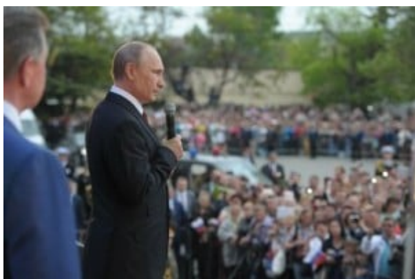
President Vladimir Putin

“During the 1990's we were a beggar nation.”