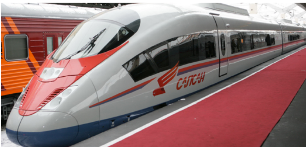
Sapsan High-Speed Train

The streets of Moscow are jam packed with new cars. Meanwhile, underground there is a fast, economical and efficient subway system which is the most heavily used in Europe. The Moscow metro carries 40% more passengers than the New York subway system. On major routes the trains arrive every 60 seconds. Some of the stations are over 240 feet underground with the longest escalator in Europe. Inter-city trains such as the Sapsan (Falcon) take passengers between St. Petersburg and Moscow at 200 kms per hour. Despite the speed, the train is smooth and quiet. It's an interesting way to view rural Russia as one passes ramshackle dachas, cute villages and abandoned Soviet era factories.