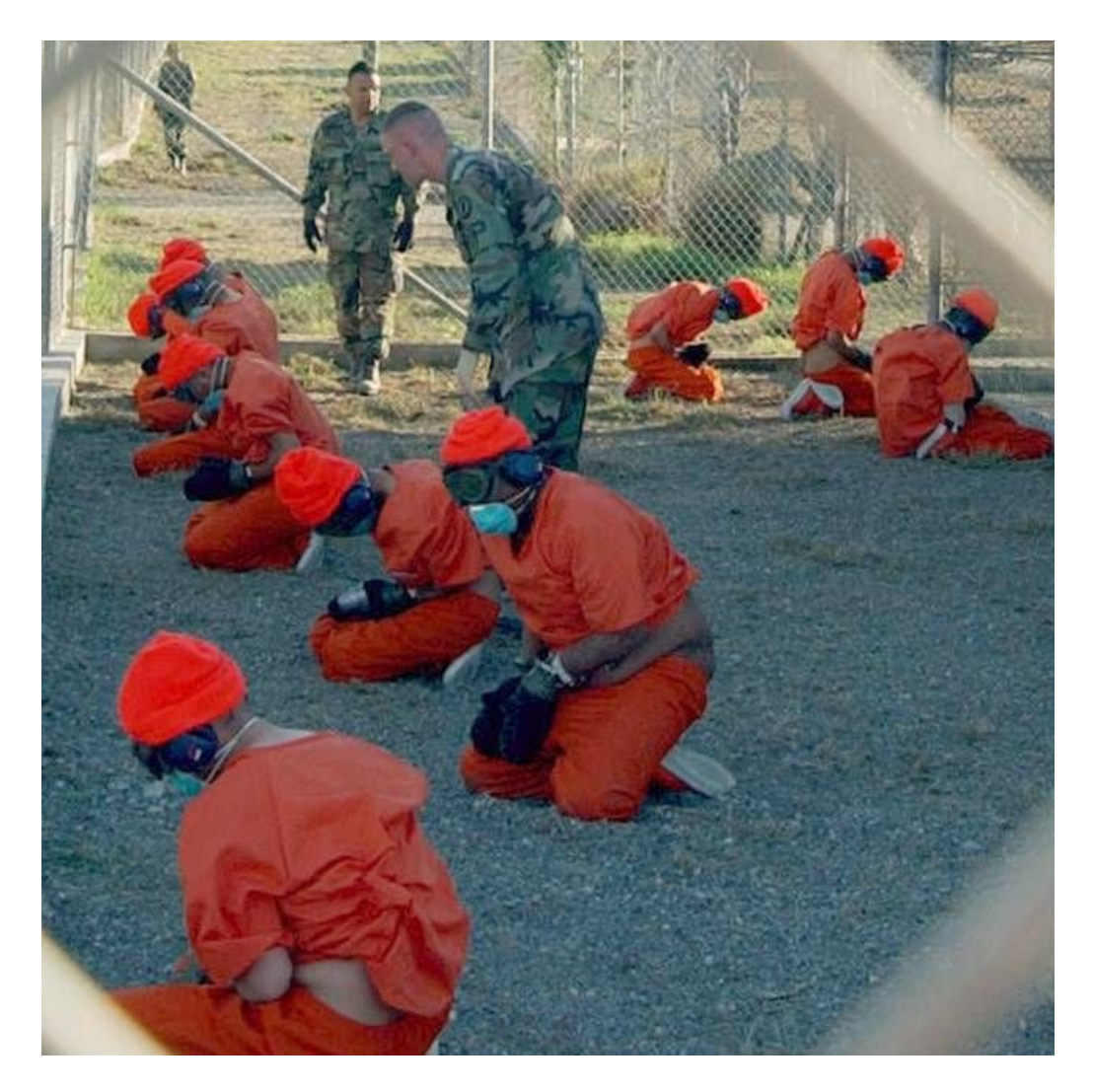
Detainees upon arrival at Camp X-Ray, January 2002

What's more, at the Guantanamo military prison, opened by George W. Bush in 2002, the US has overseen some of the worst human rights violations in the Western hemisphere.