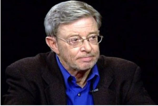
Russia scholar Stephen Cohen.