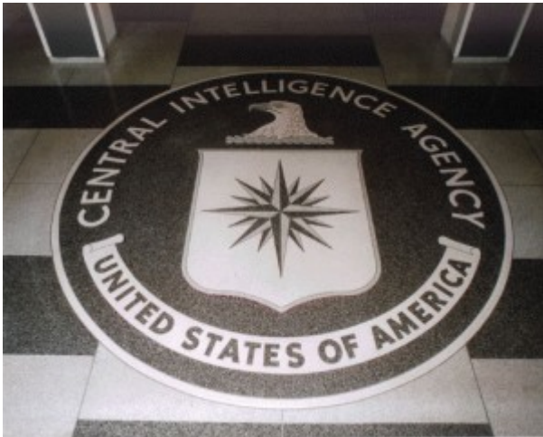
CIA seal in lobby of the spy agency’s headquarters.

In story after story, the Times doesn’t even bother to attribute the claims of Russian guilt. That guilt is just presented as flat fact even though the Russian government denies it and WikiLeaks founder Julian Assange says he did not get the emails from Russia or any other government.