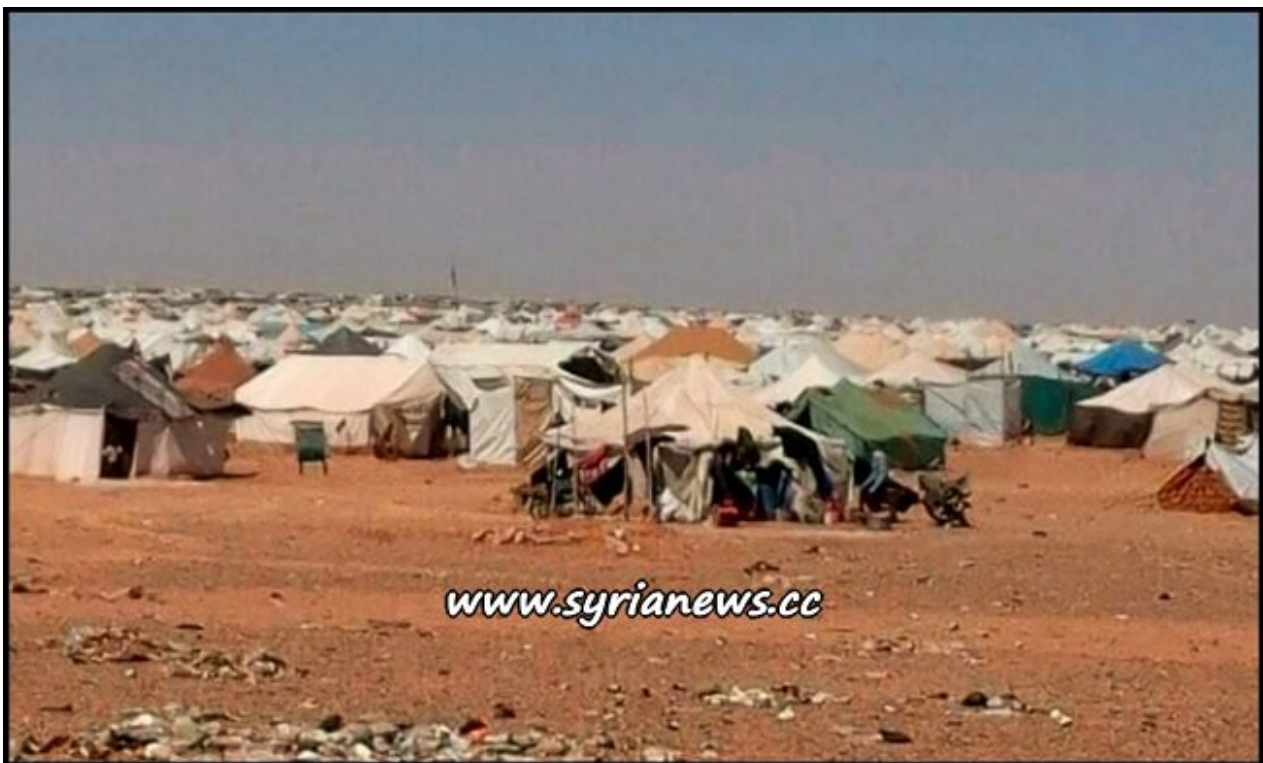
Rukban Concentration Camp for Syrian Displaced Refugees

Plans to dismantle the Rukban concentration camp were reported last October. The existence of this open air prison received massive western coverage in November, when the US finally permitted a convoy of 78 trucks filled with humanitarian aid , to safely enter. The source of the anti-Syria colonialist propaganda was "Terrorist Barbie," al Qaeda's press liaison, who omitted the facts of joint SAA, UN, & SARC convoys previously being bombed during each attempt to bring food and medicine during a 10 month period.