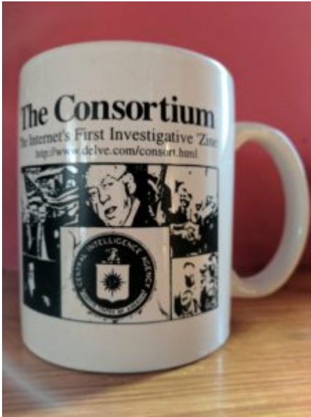
Original Consortium merchandise from 1996.

publishing. He compiled the “October Surprise X-Files” into a booklet and self-published it in January 1996.