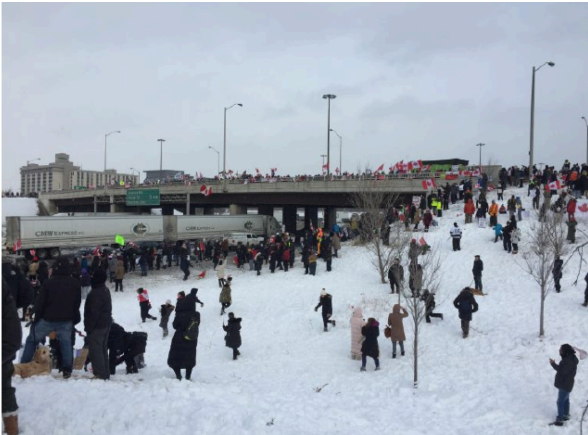
Truckers Freedom Convoy in Canada in February 2022, a movement against COVID mandates.