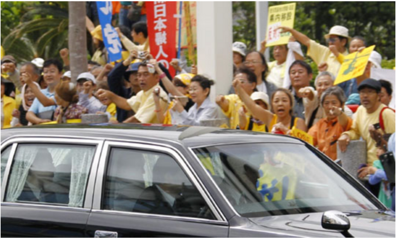
Former Prime Minister Hatoyama Yukio's reception in Okinawa (May 5, 2010)

In the ROK, the Cheonan incident may have had the unintended political effect of persuading some voters to back opposition candidates in local elections that took place shortly after the sinking. President Lee Myung-bak's tough DPRK policy in the first two years of his administration, presented as an alternative to the "soft policy" preferred by his two predecessors, appears to have been viewed with suspicion by a large segment of voters. Though other issues played a role in the election (such as environmental concerns over a large-scale river diversion project and government attacks on internet-related civil liberties), some apparently regarded policy toward the DPRK as overly harsh and hence dangerous. The election setback may also reflect significant public skepticism of the Investigative Results, doubts that one prominent South Korean NGO summed up in a letter to the UN Security Council. 9 Skepticism was strong enough to delay passage of a resolution in the ROK National Assembly condemning the DPRK for sinking the Cheonan. The resolution passed, but over the opposition of 70 legislators. 10