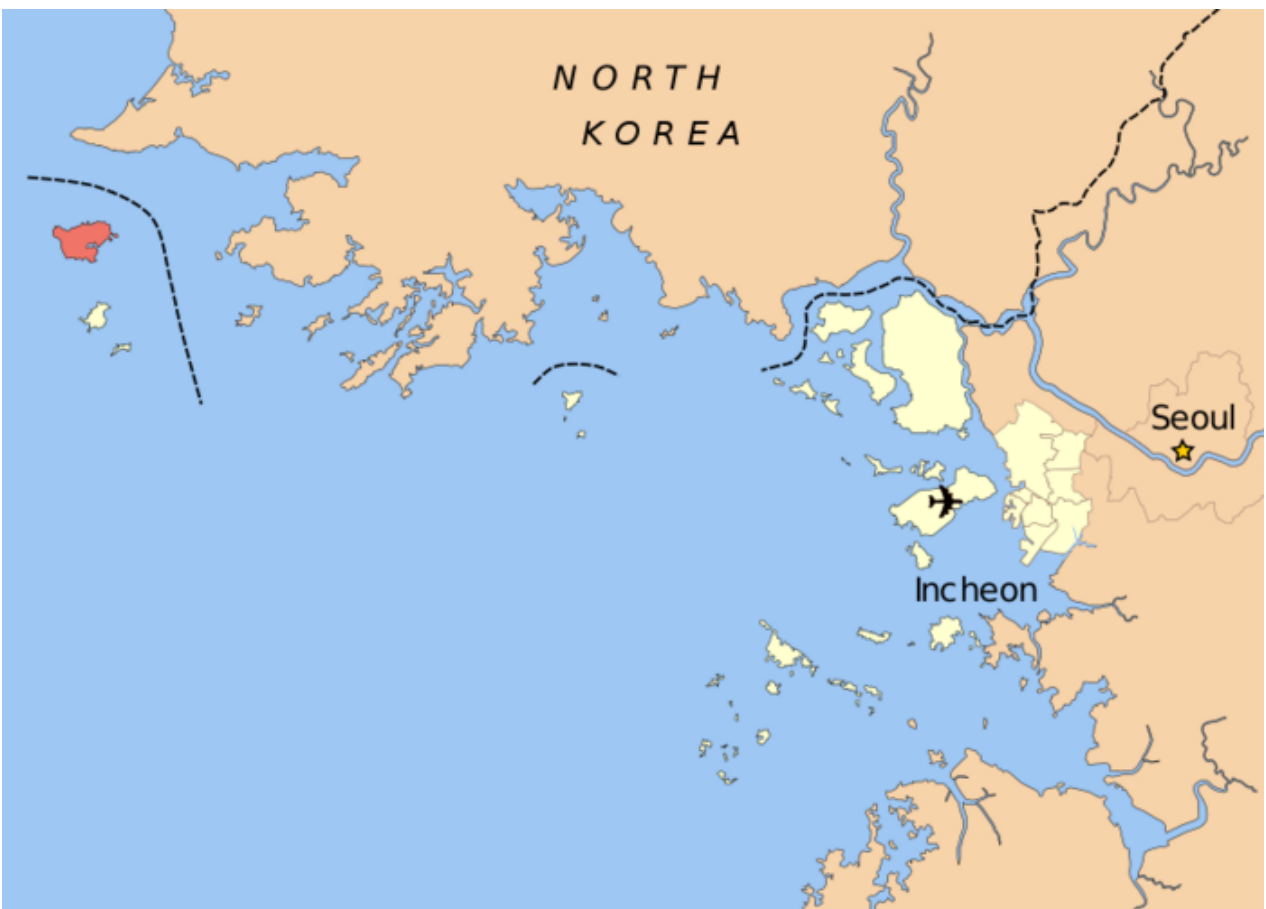
Map of Paekryong Island (in red) and vicinity (From Tanaka, "Who sank the South Korean Warship Cheonan?")