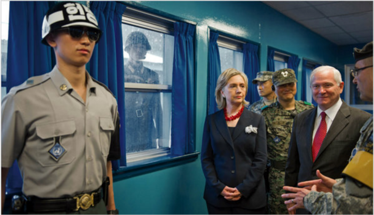
Secretary of State Hilary Clinton and Secretary of Defense Robert Gates at the DMZ, with a DPRK guard observing through the window