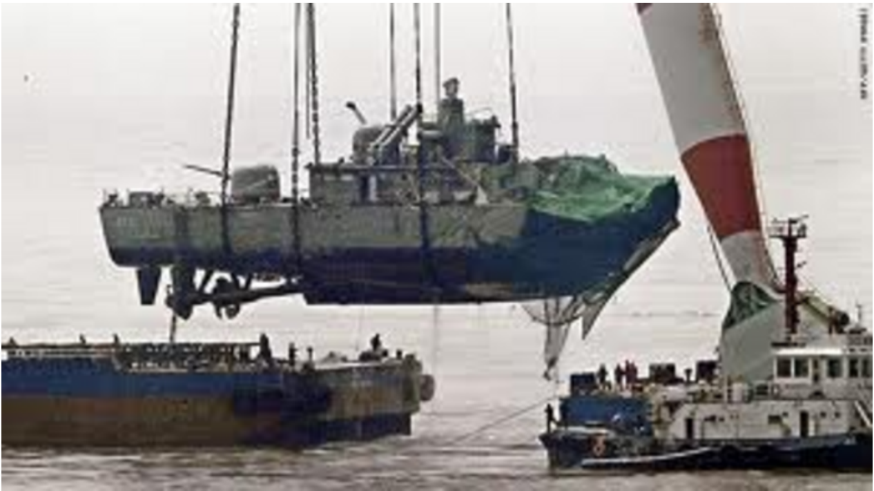
The stern of the Cheonan lifted from the water

The few critical analyses, published for the most part in blogs and alternative news websites, by contrast, have raised questions about the evidence and conclusions presented by the investigative team. A July 23, 2010 Los Angeles Times report was the first to appear in a major American paper to present the evidence calling into question the findings of the Investigative Report. 4 Some analysts proposed alternative “plausible explanation[s],” such as the Cheonan having drawn friendly fire, been hit by an exploding mine, or run aground. A third stream of analysis attempts to navigate between the two sides by examining shortcomings in the investigative process and questioning whether the Investigative Result meets claims of impartiality and objectivity. Finally, a fourth stream, while acknowledging the possibility that the DPRK did sink the Cheonan, places the incident in the historical context of similar incidents that have claimed lives from both sides of the demilitarized zone. Clear from these discussions is that reasonable doubt exists over the Investigative Result’s conclusion that a DPRK torpedo sunk the Cheonan. Further investigation involving a broader range of participants situated in a fuller context of war and conflict on the Korean peninsula is required to determine the cause of the tragedy that took the lives of 46 ROK sailors.