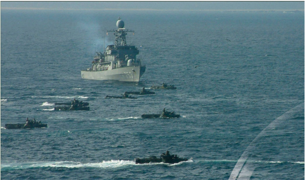
Foal Eagle exercise