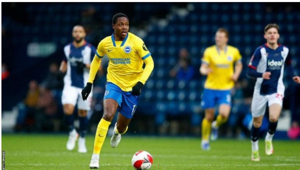
Mwepu retired from playing last year aged 24 because of a hereditary heart condition

Ex-Brighton midfielder Enock Mwepu is in hospital in Zambia after falling unwell, his former club says.