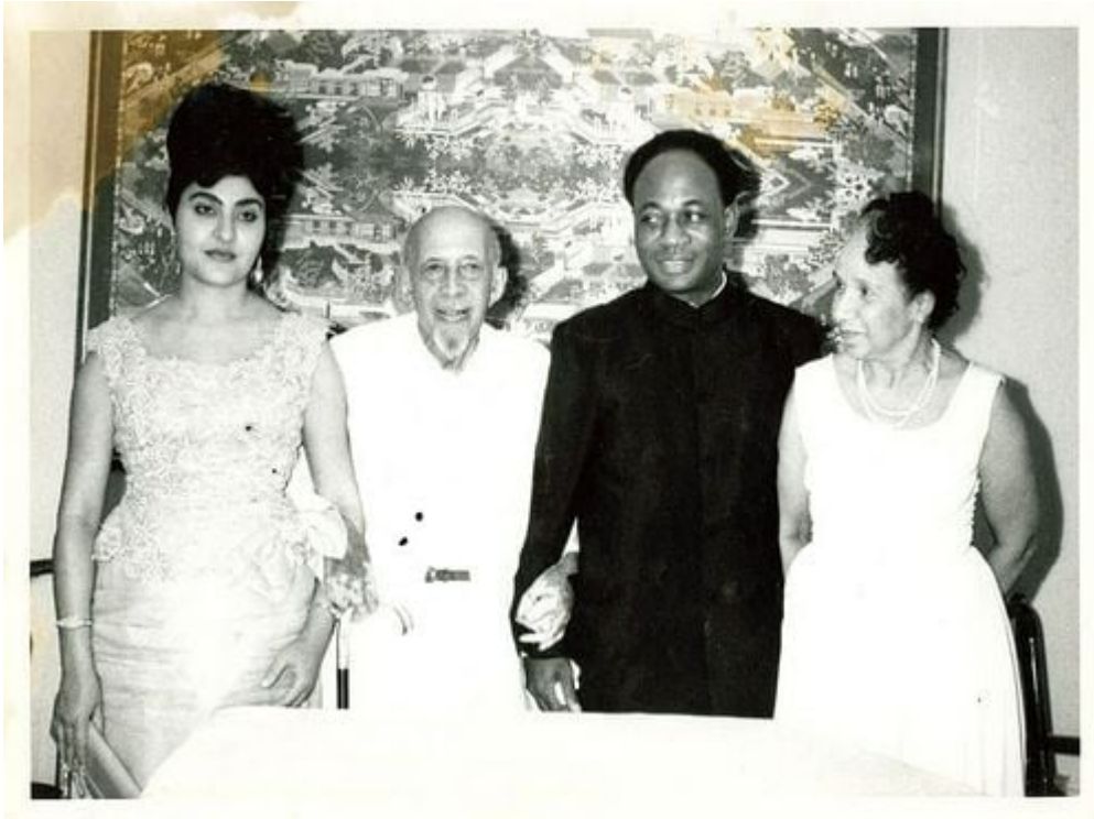
Kwame Nkrumah and Fathia with the Du Boises, Aug. 1963

1964, 1965 and 1968, which ostensibly guaranteed the right to an existence absent of discrimination on the basis of race, gender, religion and national origins.