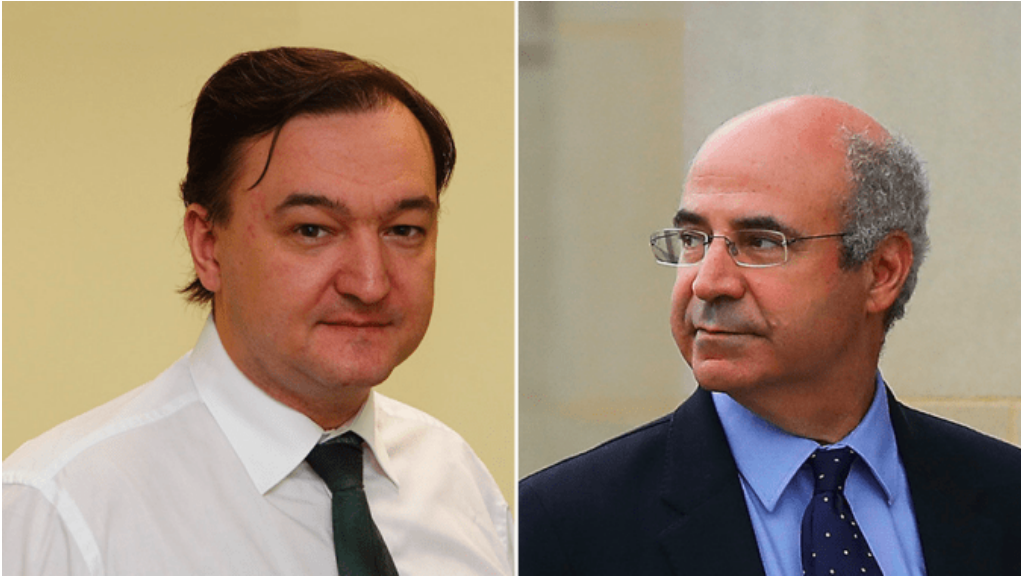
Sergei Magnitsky and William F. Browder