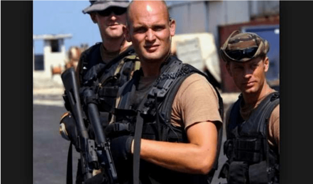
American mercenary in Donbass

Photojournalist Patrick Lancaster provided photographic evidence of Ukrainian army shelling of a school in the Donbass in violation of the Minsk peace agreements signed by both Ukraine and Russia.