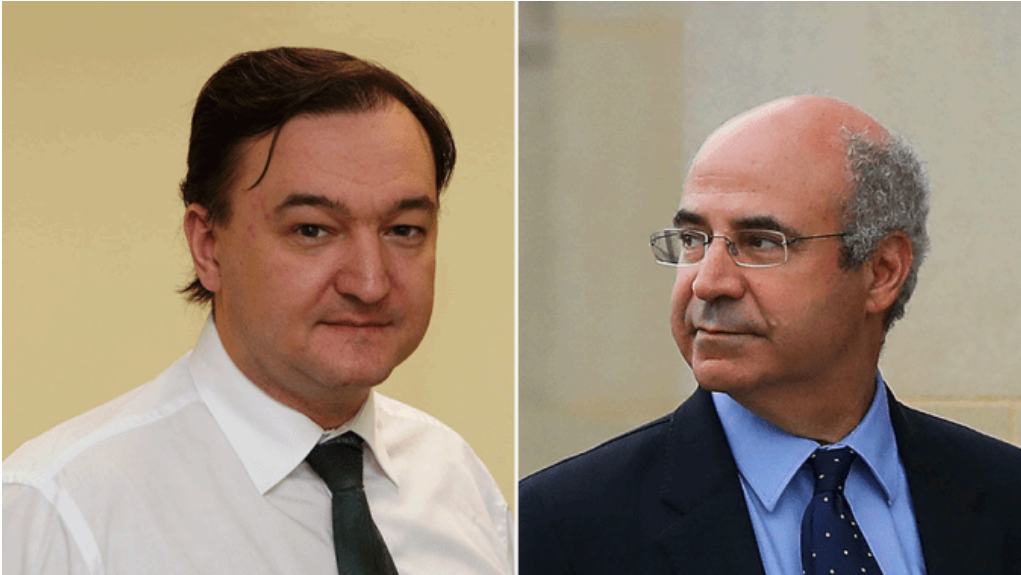
Sergei Magnitsky and William F. Browder