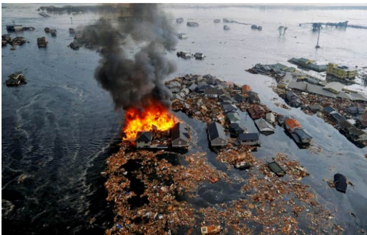
Fukushima in the wake of the Tsunami, March 2011

“While Chernobyl was an enormous unprecedented disaster, it only occurred at one reactor and rapidly melted down. Once cooled, it was able to be covered with a concrete sarcophagus that was constructed with 100,000 workers. There are a staggering 4400 tons of nuclear fuel rods at Fukushima, which greatly dwarfs the total size of radiation sources at Chernobyl.” ( Extremely High Radiation Levels in Japan: University Researchers Challenge Official Data , Global Research, April 11, 2011)