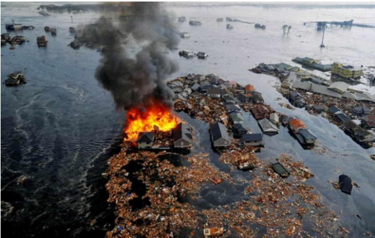
Fukushima in the wake of the Tsunami, March 2011

“While Chernobyl was an enormous unprecedented disaster, it only occurred at one reactor and rapidly melted down. Once cooled, it was able to be covered with a concrete sarcophagus that was constructed with 100,000 workers. There are a staggering 4400 tons of nuclear fuel rods at Fukushima, which greatly dwarfs the total size of radiation sources at Chernobyl.” ( Extremely High Radiation Levels in Japan: University Researchers Challenge Official Data , Global Research, April 11, 2011)