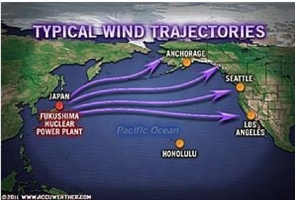
The spread of radiation. March 2011