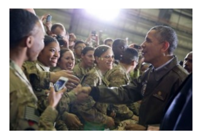
Image: President Barack Obama shakes hands with U.S. troops at Bagram Airfield in Bagram, Afghanistan, Sunday, May 25, 2014.