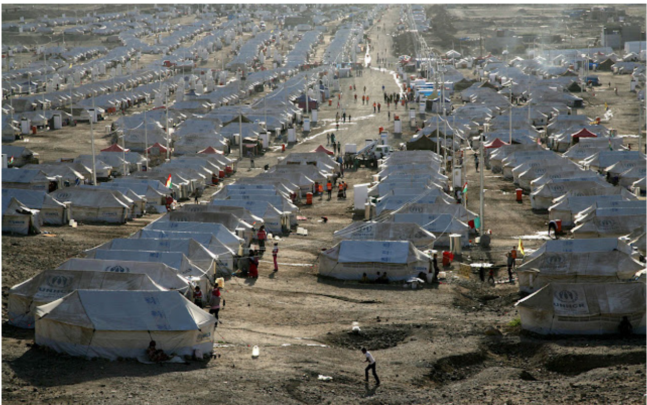
Image: Turkey has eagerly invited 2 million refugees into their country to stay at camps funded by upward to 6 billion USD, not out of altruism, but to use refugees together with the US, NATO, and the EU, as a geopolitical weapon.

In fact, Turkey has brought in over 2 million refugees with a suspiciously eager “open door” policy and has spent upward to 6 billion USD on building and maintaining these immense camps. They have done so as part of a long-standing strategy to justify creating “safe havens” in northern Syria – essentially NATO invading and occupying Syrian territory, protecting their terrorist proxies within Syria’s borders so that they can strike deeper toward Damascus and finally topple the government of President Bashar Al Assad.