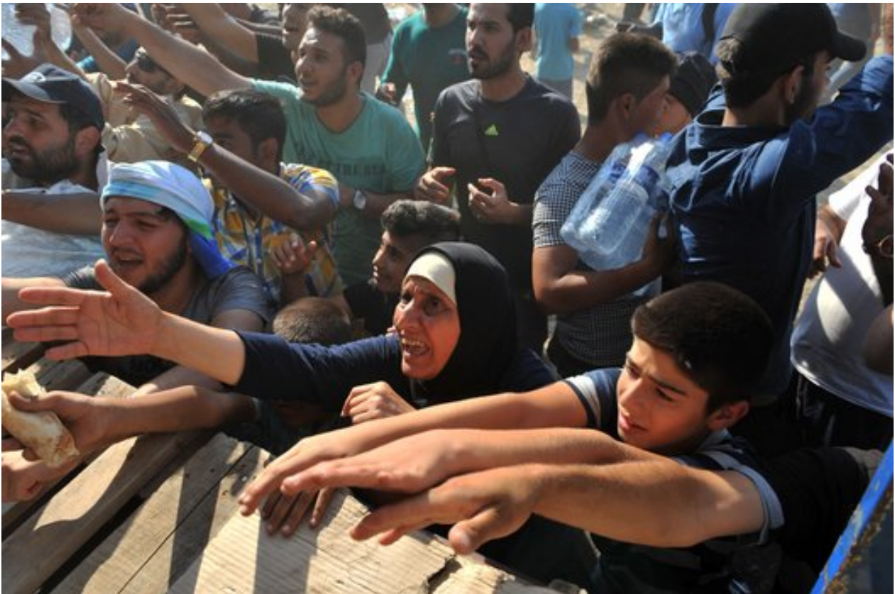
Image: The Western media ensures that articles discussing the possibility of using the refugee crisis as justification to further decimate Syria includes lots of pictures of desperate refugees struggling to burst into Europe.