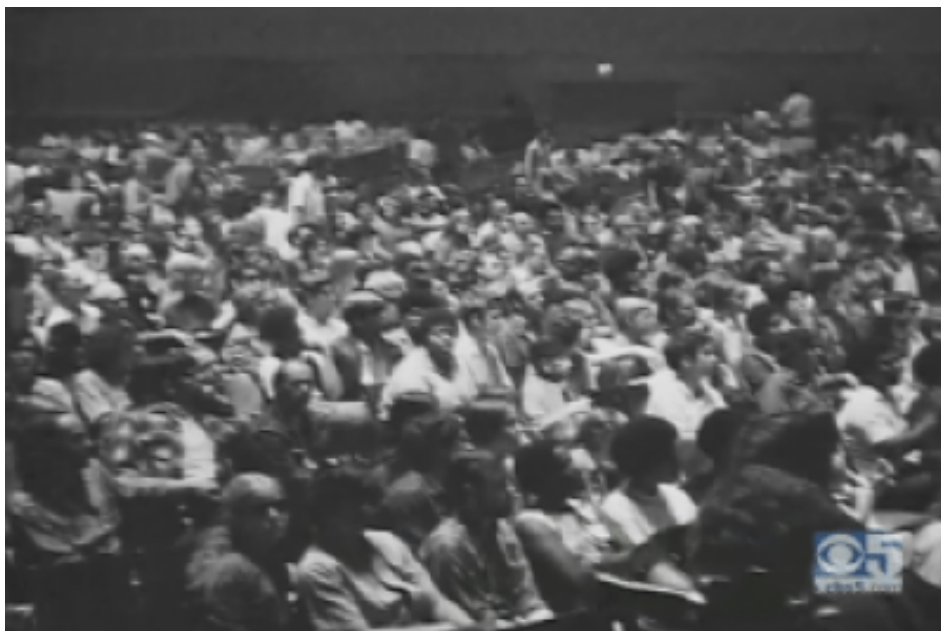
Black Panther Party led National Conference for a United Front Against Fascism delegates in Oakland, July 18-20, 1969

“Referring to SDS’s agreement to support the petition in the ‘colonies’ (black and brown communities) but not in the ‘oppressor country’ (white America), Hilliard wrote in the Black Panther: ‘How abstract and divorced from the reality of the world around them they must be to think that the Black Panther Party would allow them to leave their communities and begin to organize the colony; to control the fascists in the oppressor country is a very definite step towards white people’s power, because James Rector [a white youth killed by police in Berkeley during the confrontations over People’s Park in May 1969] was not shotgunned to death in the black community. It seems they prefer to allow the already legitimate reactionary forces to take root or sanctuary in the white communities.’ Stating that the ‘Black Panther Party will not be dictated to by people who are obviously bourgeois procrastinators,’ Hilliard went on to imply that SDS, among other groups, was ‘at best national socialist’ (i.e., fascist).” (See this )