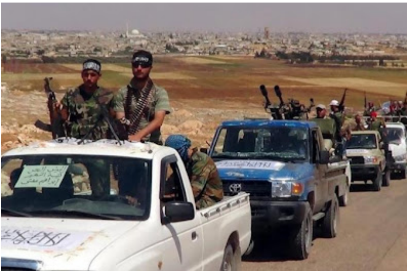
Image: Al Jazeera was running this picture along with the description, "Syrian rebels near Aleppo city, as they took much of the formerly loyalist city from the government." Heavy weapons can be seen mounted on several of the trucks, and images like this are increasingly common as militants attempt to enter cities like Damascus and Aleppo where

The West has eagerly described this violence in Syria as a "civil war," yet has conveniently continued to depict their heavily armed, foreign-backed fighters streaming across Syria's borders as "citizens" and "civilians," even as their ties to Al Qaeda and other foreign militant groups become ever more apparent . In fact, Iraqi officials are already linking the recent bombings in their country by Al Qaeda to the same forces and backers of the so-called "Free Syrian Army" (FSA) in Syria.