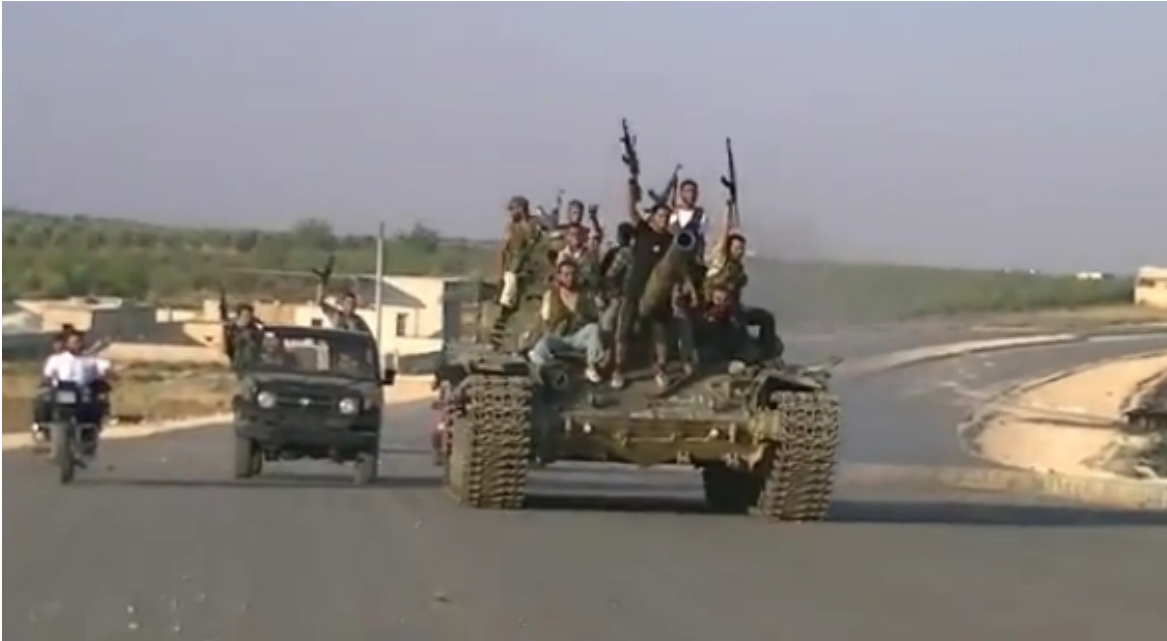
Image: The West's "lightly armed" FSA. ABC (Australia) claims this is a picture taken this week of an FSA-seized tank on the outskirts of Aleppo, Syria. One wonders if this tank was rolling along the outskirts of Washington in the middle of a war, whether or not the US would use airstrikes to neutralize it.