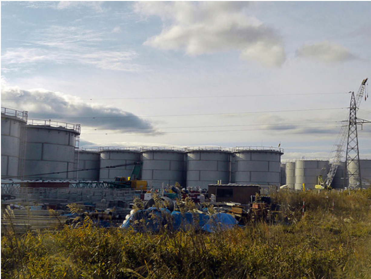
Storing contaminated water in tanks at the Fukushima Daiichi site presents an ongoing risk, says Makhijani.

MAKHIJANI: Well, they have to develop the robots, and I think that developing them, by looking at reactor two, and they're finding these surprises, radiation levels much higher than previously measured. It shouldn't actually be unanticipated. The big surprise here was that a part of the grating was gone, and so that the molten fuel would possibly have gone through the grating. So, I think similar surprises will await reactors one and three because each meltdown will have a different geometry.