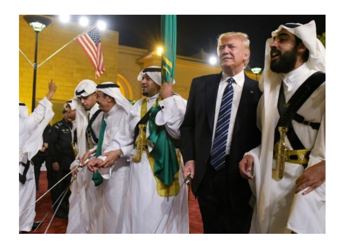
Trump in Saudi Arabia

Adding to regional tensions, Qatar believes it is the rightful ruler of the Nejd, the central part of Saudi Arabia. Doha has also suggested that relations with Iran might be better served by diplomacy rather than saber-rattling. The Saudis have contributed to political strains by their 1974 "incursion" into Qatar, and their current demands that the country surrender most of its sovereignty, including shutting down Al Jazeera , the Doha-controlled news network that sometimes criticizes authoritarian states in the area.