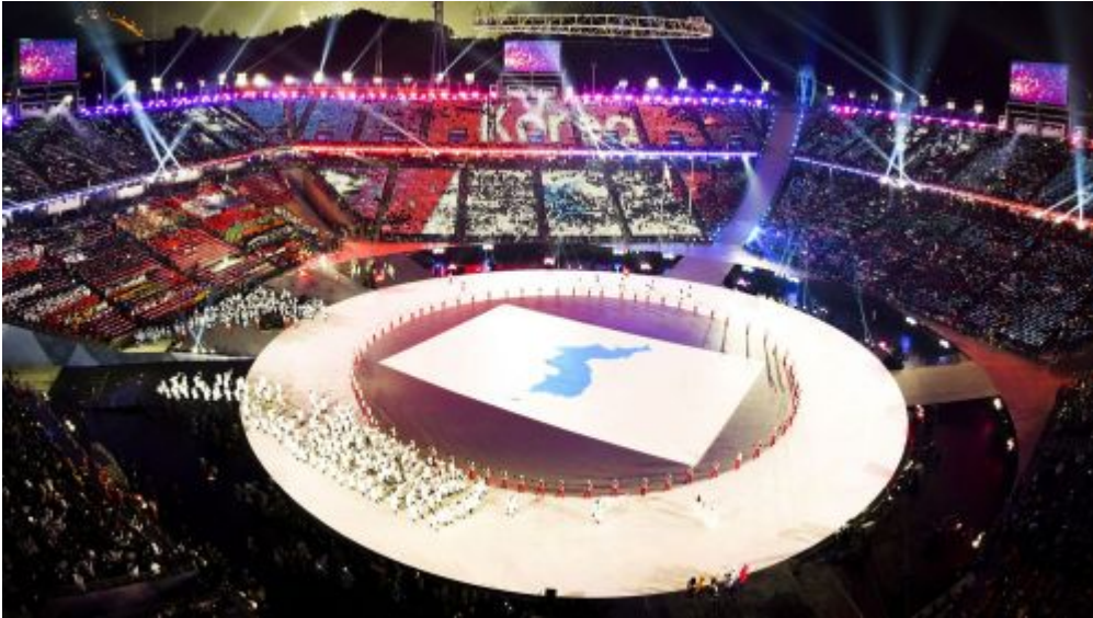
Photo shows joint Korean delegation entering PyeongChang Olympic Stadium at the opening ceremony, February 9, 2018, ending the parade of nations. The Korean Unification Flag takes centre stage and flashes across the stadium seats with the name “Korea.”

Instead of respecting this initiative, the sports media has taken up the theme of Washington and NATO that the creation of a unified Korean sports delegation of the ROK and DPRK athletes constitutes a “charm offensive,” a short-lived “manipulation” and a onetime symbolic stunt of the Democratic People’s Republic of Korea. The sincere aspirations of the Korean people to unite their divided nation made short shrift of the views repeated ad nauseam by the imperialist press.