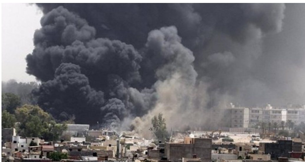
NATO-led destruction of Libya, 2011

This is just a glimpse into the utter chaos and degradation that Libya has descended into after NATO ' liberated ' the country back in 2011, and it provides a window into what Syria would be like if the West forces regime change in Damascus.