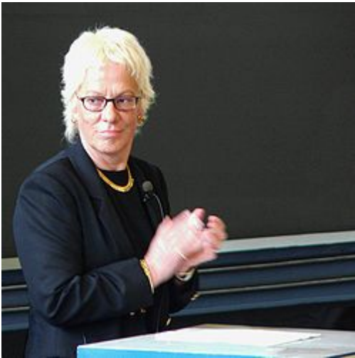
Carla del Ponte

On multiple occasions, investigations have indicated that chemical weapons have been used by the Syrian opposition. In May 2013 for instance, the Commissioner of the UN's Independent International Commission of Inquiry for Syria, Carla Del Ponte, said in an interview that there was evidence which suggested that the rebels, not the Syrian army, used chemical weapons: