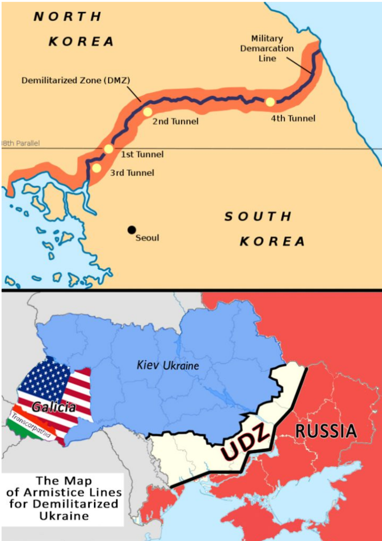
Map from John Helmer

Here is an excerpt from an article by Moscow-based journalist John Helmer who thinks the Russian army will clear a vast area of central Ukraine in its upcoming winter offensive, and that much of that land will become part of a 100 kilometer-wide Demilitarized Zone (DMZ) that will protect Russia from Ukrainian missile and