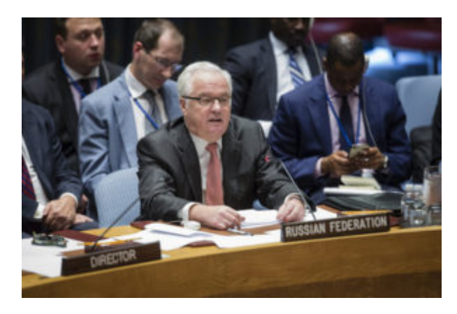
Vitaly I. Churkin, Permanent Representative of the Russian Federation to the UN, addresses the Security Council meeting on Syria. Sept. 25, 2016.

Gen. Harrigan's strike worked like a charm in terms of the interests of those behind it. The hope of provoking a Syrian-Russian decision to end the cease-fire and thus the plan for the JIC was apparently based on the assumption that it would be perceived by both Russians and Syrians as evidence that Obama was not in control of U.S. policy and therefore could not be trusted as a partner in managing the conflict. That assumption proved correct.