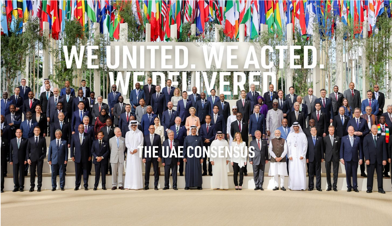
Psychopaths of the World United!

How to develop a long-term systemic approach to achieve a carbon-neutral world by 2050.