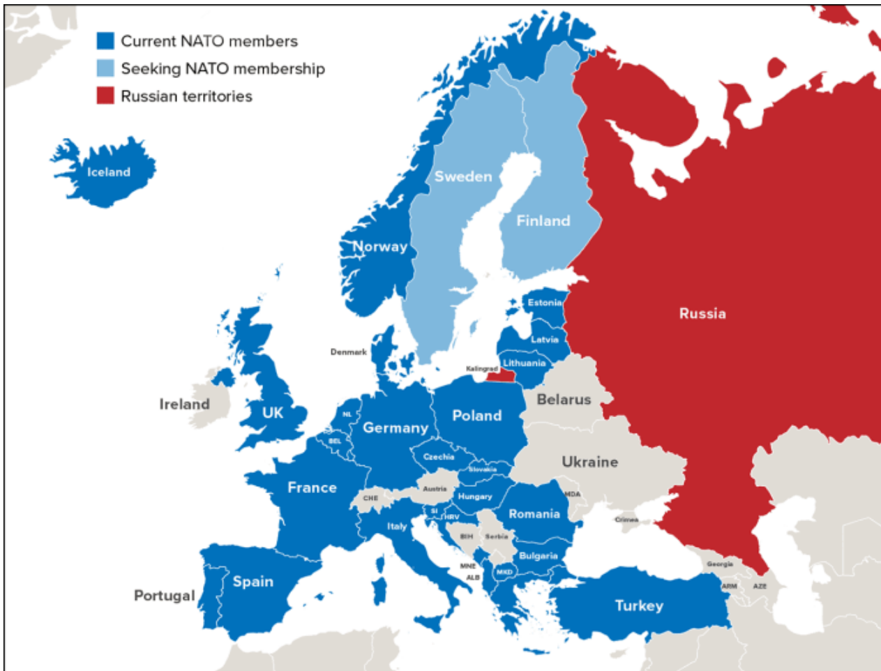
Europa 2022.