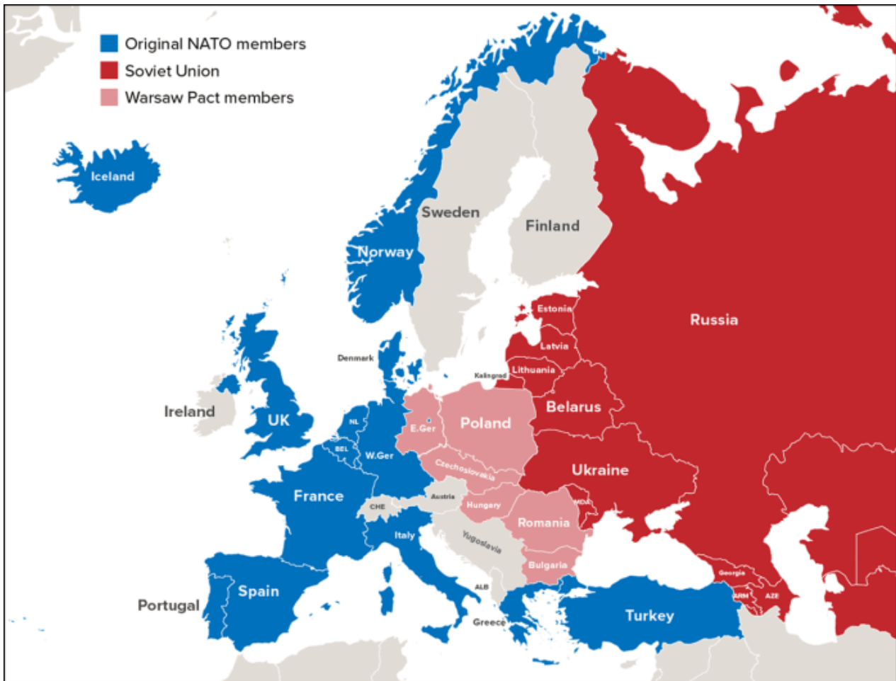
Europa 1990.

The illustration above shows that in 1990—year 1 after the fall of the Berlin Wall—the Russian-dominated Soviet Union included Ukraine, the Baltic States and several other now independent countries. The Warsaw Pact, an alliance also dominated by Russia, included six states, all of which are also independent today.