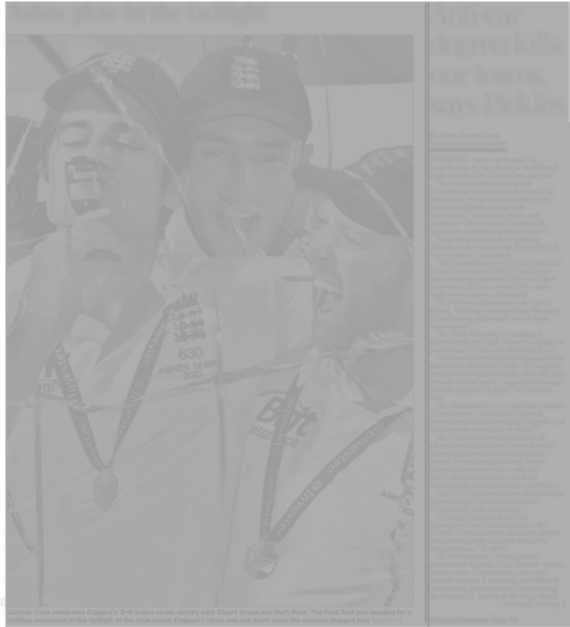
Stuart Broad celebrates England's 3-0 Ashes series victory with Stuart Broad and Matt Prior. The Test was heading for a thrilling conclusion in the twilight at the Oval before England's chase was cut short when the umpires stopped play. (1/17)

Reports: Pages 12 and 13 Editorial Comment: Page 17