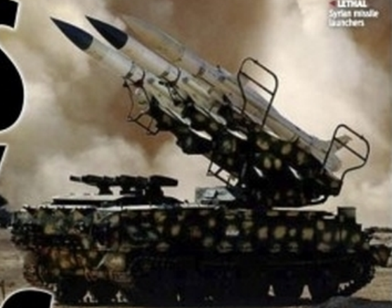
LETHAL Syrian missile launchers

EXCLUSIVE by CHRIS HUGHES, Security Correspondent BRITISH special forces were last night hunting Syrian missiles in readiness for Allied strikes which could start as early as tomorrow night. Cruise missile attacks and RAF raids are expected in response to the Assad regime's use of chemical weapons. A military source said: "It is vital they find every missile site that could threaten British ships or RAF jets and