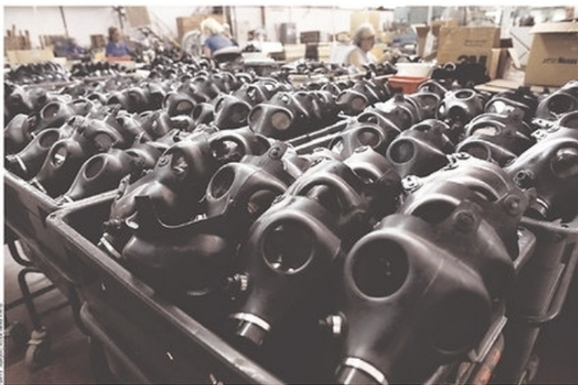
Police say Israelis are crowding gas-mask distribution facilities, readying for possible retaliation after any strike on Syria. Above, an Israeli mask factory.

DJIA 14840.95 ▲ 16.44 0.1% NASDAQ 3620.30 ▲ 0.8% NIKKEI 13459.71 ▲ 0.9% STOXX600 300.13 ▲ 0.8% 10-YR. TREAS. ▲ 7/32, yield 2.756% OIL $108.80 ▼ $1.30 GOLD $1,412.90 ▼ $5.70 EURO $1.3241 YEN 98.35