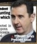
TURN TO PAGE 5

EXCLUSIVE by CHRIS HUGHES, Security Correspondent BRITISH special forces were last night hunting Syrian missiles in readiness for Allied strikes which could start as early as tomorrow night. Cruise missile attacks and RAF raids are expected in response to the Assad regime's use of chemical weapons. A military source said: "It is vital they find every missile site that could threaten British ships or RAF jets and