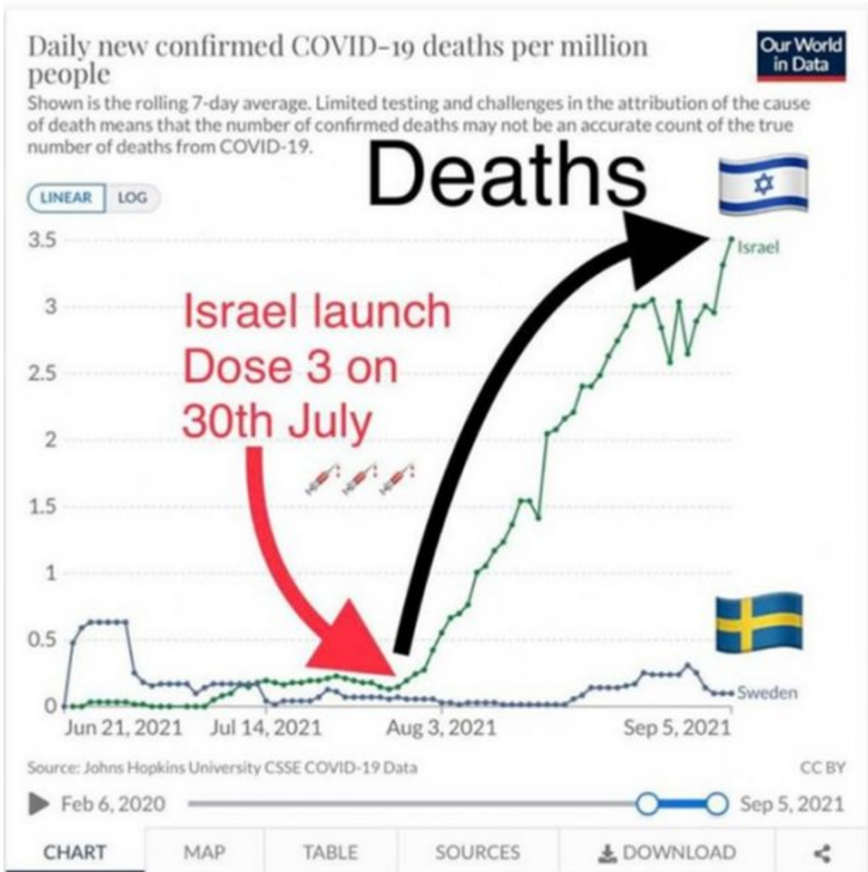
Chart from Citizen Free Press

Below is a graphic based on data from John Hopkins University that shows a sharp rise in Covid deaths after the booster was introduced in Israel at the end of July.