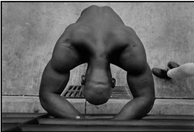
James Nachtwey / VII

For anyone paying attention, there is no shortage of issues that fundamentally challenge the underpinning moral infrastructure of American society and the values it claims to uphold. Under the conceptual illusion of liberty, few things are more sobering than the amount of Americans who will spend the rest of their lives in an isolated correctional facility – ostensibly, being corrected. The United States of America has long held the highest incarceration rate in the world , far surpassing any other nation. For every 100,000 Americans, 743 citizens sit behind bars. Presently, the prison population in America consists of more than six million people, a number exceeding the amount of prisoners held in the gulags of the former Soviet Union at any point in its history.